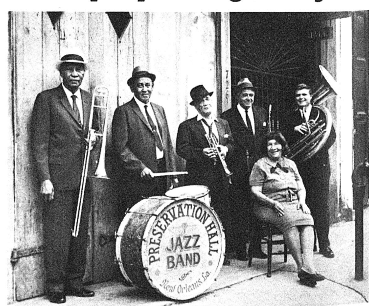
PLAY THAT HORN and pour out that soul! The old timers are the only ones left who can play jazz the way it should be. If you'd like a taste of the real jazz, you can listen to the Preservation Hall Jazz Band in Dinwoodie Friday.

in Jamaica. The Unit hopes to keep records of students at Universities and Institutions of higher education over-