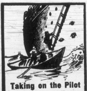
Taking on the Pilot

"Truth for authority, not authority for truth."