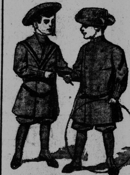
Russian, Sailor and Military Styles.

Give your boy the freedom and comfort nature intended he should have. Now that he is away from school, let him get away from those heavy cloth suits. Our Wash Suits are the essence of holiday comfort, loose, cool, and light, if easily soiled, easier cleaned, and they wear well, too. Made from good quality goods, as Prints, Linens, Chambrays and Madras, in styles they are shown the Russian, Sailor and Military effects. These the two leading styles known to the trade. The colors are in plain white, blue and tan, in fancies, stripes, plaids and checks, in light, medium and dark grounds. Suits having sailor collars are trimmed with self and combination trimmings giving them that smart effect of an up to date wash suit. The Military styles have fancy trimmings, these button close to the neck, neat, jaunty and soldierly looking. These please the boys.