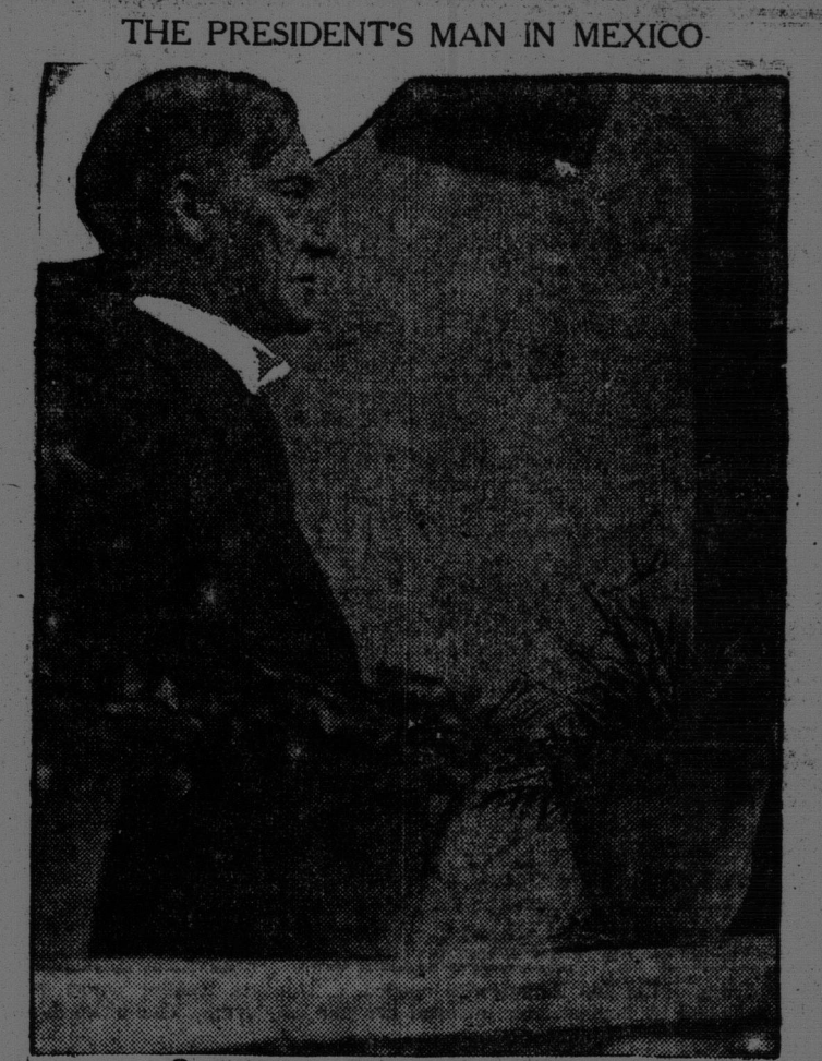
THE PRESIDENT'S MAN IN MEXICO. Es-Governor John Lind, who is president Wilson's personal representative in Mexico. The photograph shows him on the balcony of the American consulate in Vera Cruz.