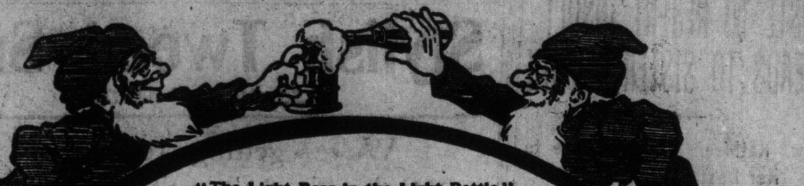
"The Light Beam in the Light Bottle" (Registered)