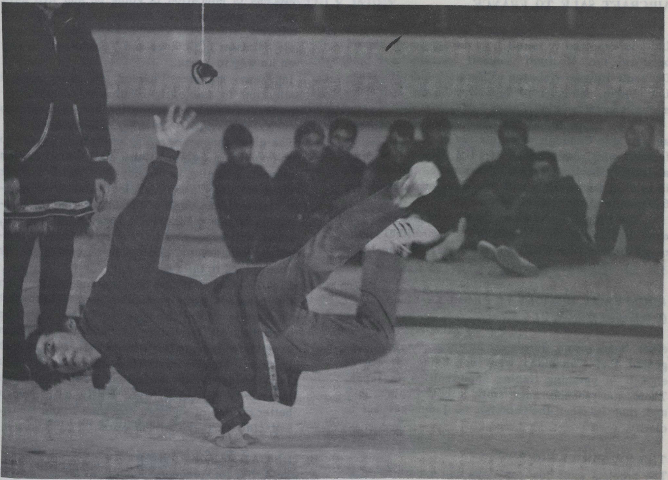
A competitor in "a handstand game" balances his body on two hands then throws one hand up in an attempt to touch a piece of leather suspended from a string above him. The leather is lifted higher and higher until a winner is declared.