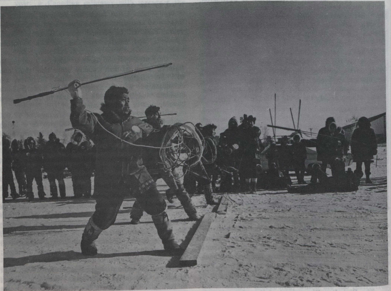
Contestants in the harpoon contest

The Governor General said in his opening address that the establishment of the Games was "a mark of the character and determination of our northern compatriots". "It is evidence, too," he declared, "of a growing independence among northern people and a feeling that they have a community life of their own which is distinctive and viable."