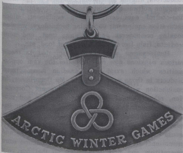
Medals given to winners in the Arctic Winter Games show the Games' emblem, three rings tied with a love knot, representing the three areas above the 60th Parallel from where contestants come.