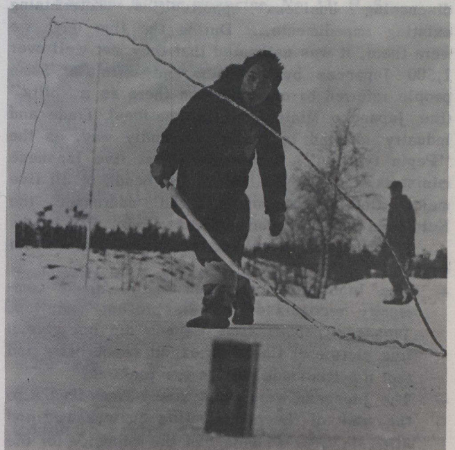
A 30-foot whip is used in the Eskimo sport of ipirautaqturniq to flick tin cans from a snowbank.