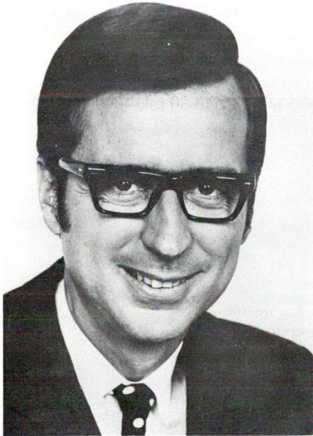
Quebec Premier Robert Bourassa.

Premier Robert Bourassa of Quebec, on an official visit to France at the beginning of December, had several discussions with French President Valéry Giscard d'Estaing and several other officials of the Republic.