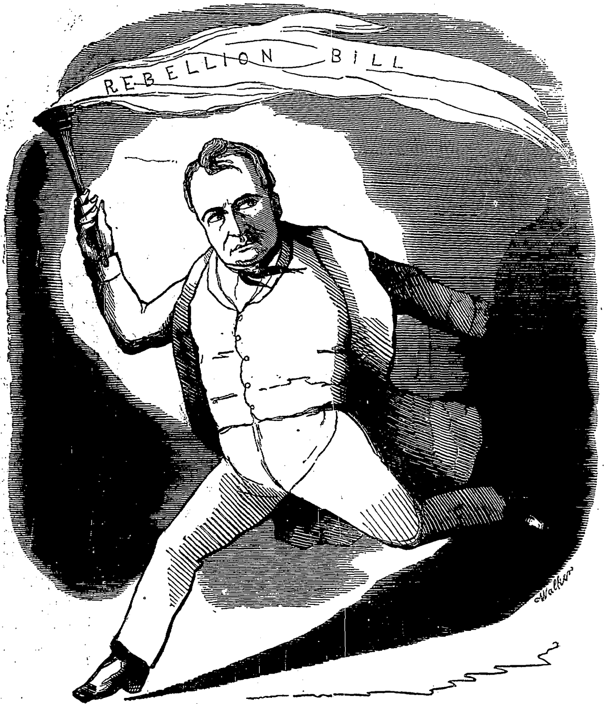
The Man wot fired the Parliament House!