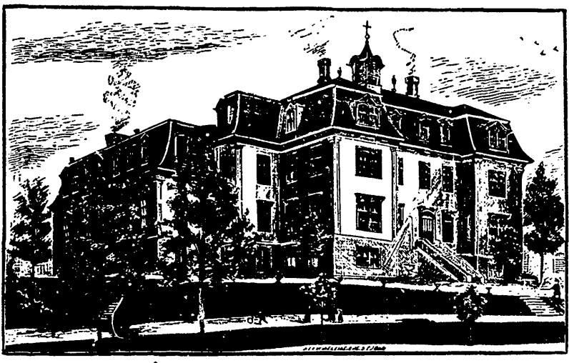
ANTIGONISH, N. S.

(Under the control of the Sisters of the Congregation de Notre Dame )