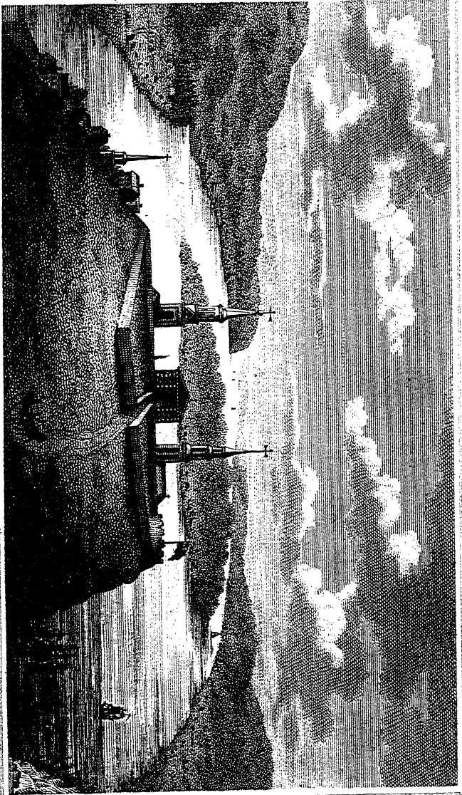
Taken from Memory.