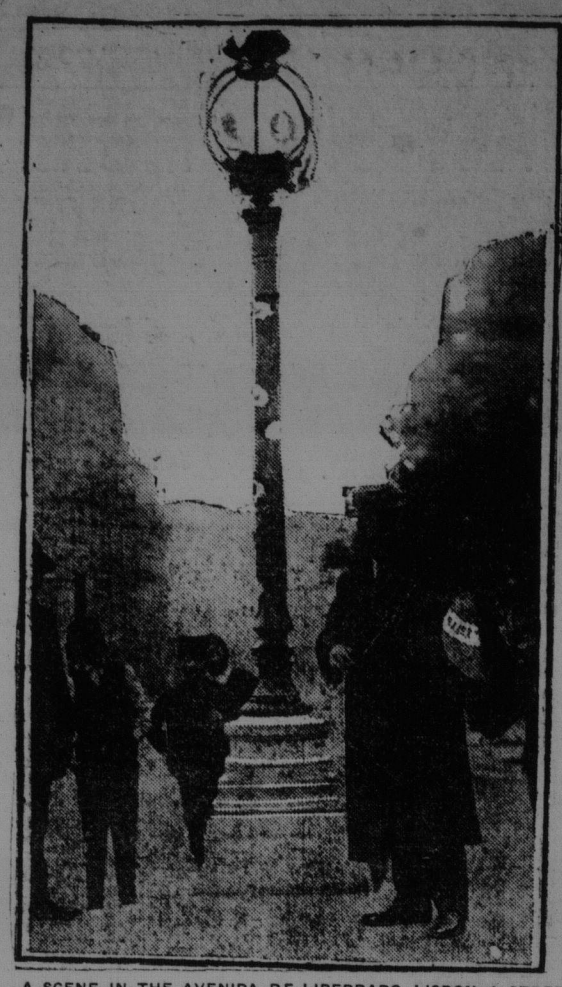
A SCENE IN THE AVENIDA DE LIBERDADO, LISBON, A STREET WHICH WAS SWEPT BY THE ARTILLERY FIRE OF THE REVOLUTIONISTS ON THE PORTUGUESE WARSHIPS. FIVE SHOTS PASSED THROUGH THE LAMPPOST, YET, CURIOUSLY, IT REMAINED UP.