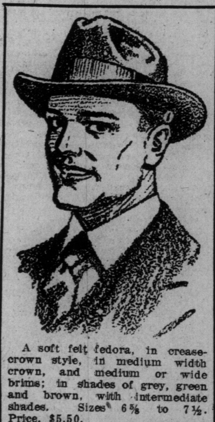
A soft felt fedora, in crease-crown style, in medium width crown, and medium or wide brim; in shades of grey, green and brown with intermediate shades. Sizes 6 1/2 to 7 1/2. Price, $5.50.

Big Saving Opportunities in Trunks Today at $5.25 Trunks of such durability as these offered at these prices are surely remarkable and opportunities for saving such as this are few. They are square style, covered with waterproof canvas, have 1/2 inch hardwood slats running to outer edge of trunks, brass finished metal corner protectors, sheet iron binding, good lock and valance clamps. Suitably lined and tray. Sizes 32 x 18 x 19; 36 x 20 x 22, greatly reduced. Today, each, $5.25. —Basement, Centre.