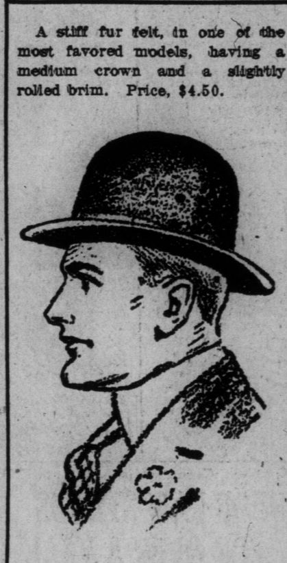
A stiff fur felt, in one of the most favored models, having a medium crown and a slightly rolled brim. Price, $4.50.