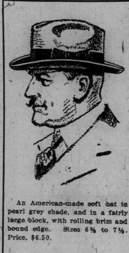
An American-made soft hat in pearl grey shade, and in a fairly large block, with rolling brim and bound edge. Sizes 6 1/2 to 7 1/2. Price, $6.50.

Good Snapshots Enlarged Today for 25c "Dig Up" the films of all the good photos you've taken lately—even those of last summer, choose the best of them, and bring them to the Camera Counter this morning to be enlarged for 25c each. It's a one-day price, and certainly is low for an enlargement of this size and finish. It is 5 x 7 inches, finished in black and white, and mounted on grey card 8 x 10 inches. Today, from film, 25c; from print, 50c and up, according to retouching necessary.