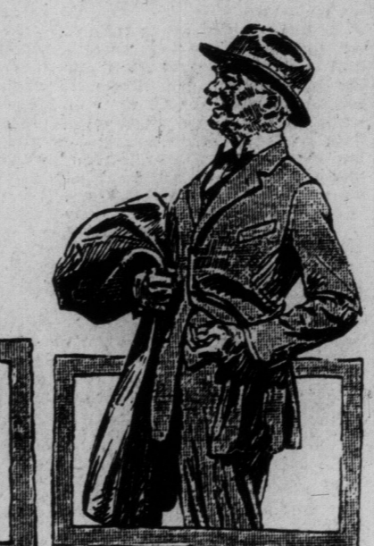
A conservative hand-tailored model, cut on smart lines for men—a three-button, semi-form-fitting style; of all-wool Saxony-finished worsted, in dark blue, having an invisible thread stripe. Price, $62.50.

At Any Rate it is Doubtful if, at Any Time, There Was a Greater Diversity of Refreshing Styles, Durable Fabrics and Appealing Patterns Gathered Together in the Men's Clothing Section—It's a Display Worth Seeing