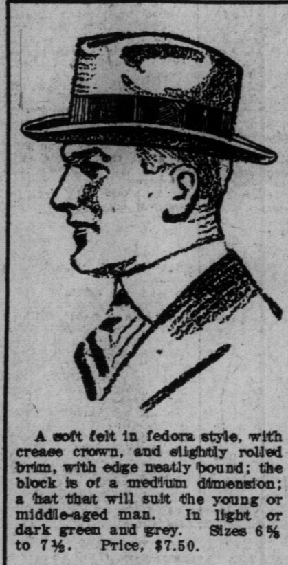
A soft felt in fedora style, with crease crown, and slightly rolled brim, with edge neatly bound; the block is of a medium dimension; a hat that will suit the young or middle-aged man. In light or dark green and grey. Sizes 6 1/2 to 7 1/2. Price, $7.50.