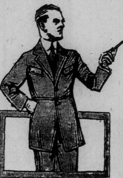
Young men's two-button, single-breasted worsted suit with flare skirt, soft roll notch lapels, natural shoulders, two outside breast pockets with flaps—of a cassimere finished wool and cotton mixed tweed—in Lovat shade, showing an ox-blood overcheck. Price, $25.00.

A young man's high-waisted wool and cotton tweed, form-fitting, two-button, single-breasted suit, almost straight fronted; of dark blue fancy mixture, showing a green thread stripe. Price, $30.00.