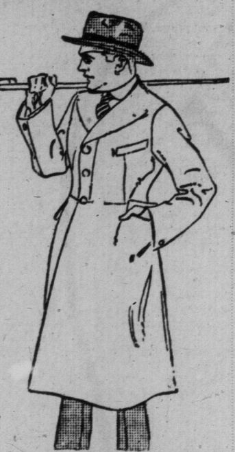
Young man's overcoat, in single-breasted, form-fitting, button-through style, with slash pockets; quarter lining; peaked lapels—of dark, fancy and grey tweeds. Price, $22.50.

A young man's all-ground belted coat of wool and cotton mid-grey Banockburn tweed, with quarter lining, patch pockets and rolling peaked lapels. Price, $22.50.