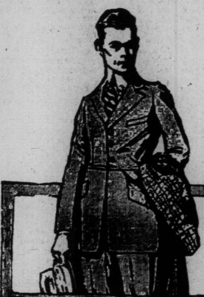
A young man's suit of a rich dark brown English worsted, in the waisted style, with regular body pockets having flaps; flare skirt without vent. Price, $42.50.