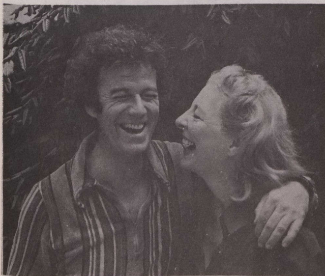
Gordon Pinsent and his wife Charmion King know how to make each other laugh, a talent they exercise frequently.

Then, after an absence of five years, the CBC offered to let him make a 30-minute "special" to his own specifications. Though he duly re-enacted one of