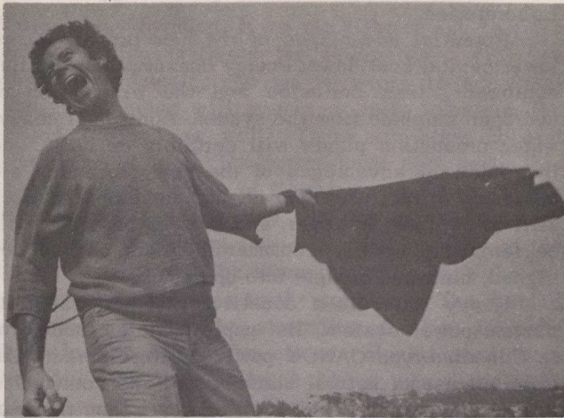
"Lovely Tell Your Mother" — the jaunty, carefree battlecry of The Rowdyman .

By the time Canadian viewers had become familiar with his face on television, Gordon Pinsent, who wrote the scenario for The Rowdyman and played the title role, found himself type-cast as a politician. Canadians identified him with the Member of Parliament from Moose Falls who gave his name to the weekly TV series Quentin Durgens, M.P. , carried on the Canadian Broadcasting Corporation English network.