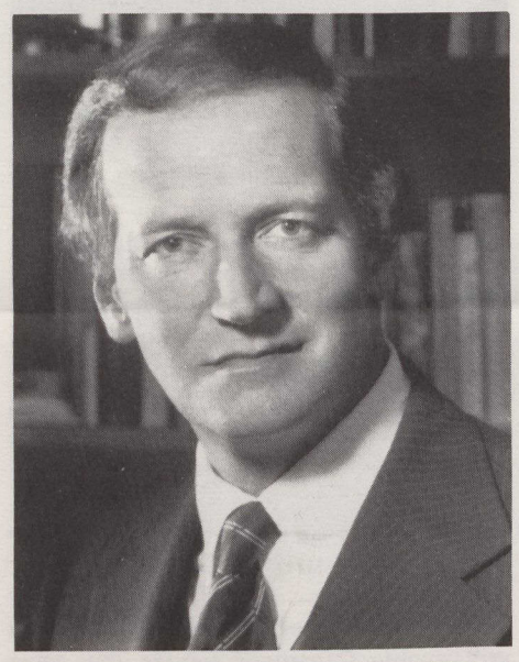
Minister of State (International Trade) Gerald Regan.

The policies adopted by countries will vary greatly depending on their economic size, commercial competitive advantages, position as capital importer or exporter, or host or home country to multinational enterprises (MNEs) and their international political role and perceptions. Canada and Australia, as primarily host countries to foreign investment, employ investment screening mechanisms and may restrict foreign involvement in some sectors for cultural or economic reasons. The investment restrictions of large home countries, like the US and Britain, are often on a sectoral basis and involve considerations of security and defence as well as economic considerations. France and Japan employ a variety of administrative measures to protect their trade and investment interests.