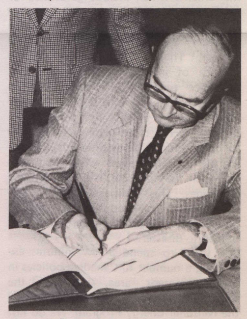
Consul General Jean-Yves Grenon signs convention in Strasbourg.

The agreement is the fourth international pact concluded by Canada on this