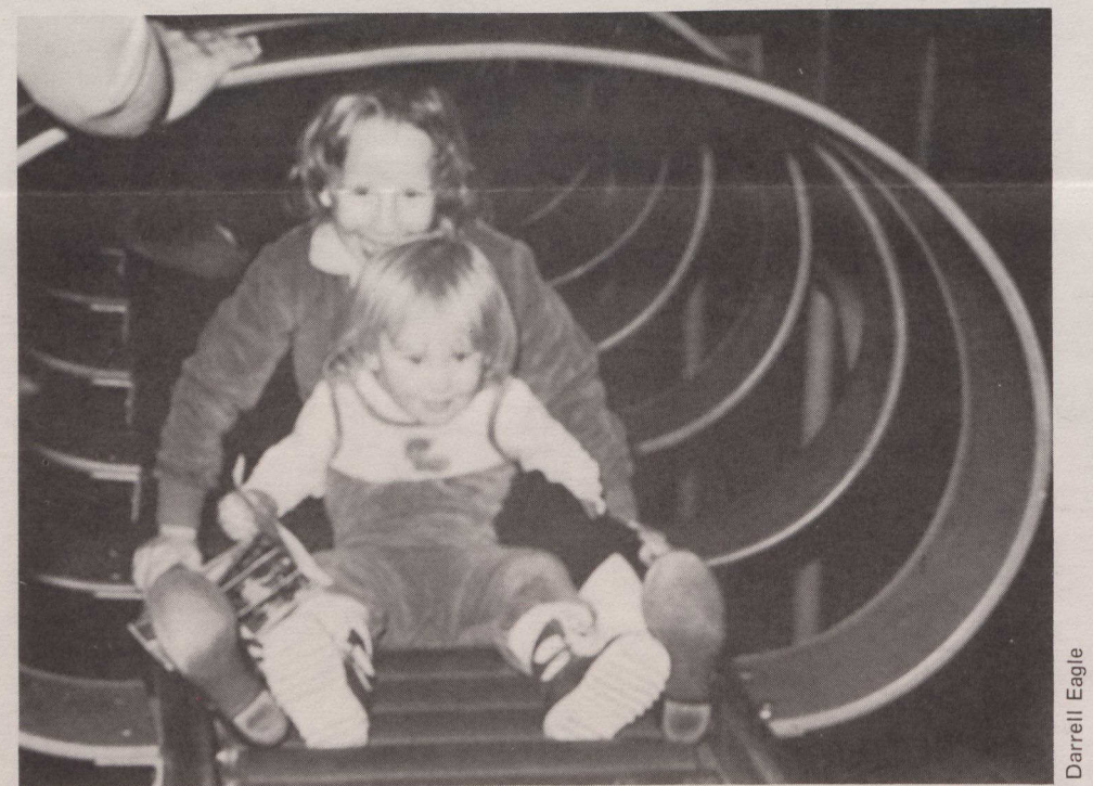
Hilan playstructures for handicapped children, like this roller slide made of soft rubber, integrate with conventional playground equipment.

- Hilan Playstructures for handicapped children, which integrate with conventional playground equipment, were developed and tested with support from HTIP. The innovative structures include sympathetic swings which are set in motion by the action of an adjoining conventional swing; playhouse with wheelchair accessibility; riding saucers which respond to rolling and crawling, and roller slides made of soft rubber. Hilan Playstructures are appealing to all children, whether handicapped or not. They can be added to regular playground equipment in parks, schools and community centres to encourage the natural integration of disabled and able-bodied children. The play equipment is produced and marketed by a firm located in Almonte, Ontario near Ottawa.