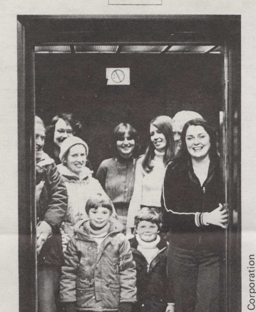
Passengers listen to EVA, a system developed under the program. EVA is an electronic voice announcer that is especially helpful to the blind because it audibly identifies floors for elevator users.

demonstration and testing of practical factors related to the installation of exterior insulation in basement walls in various climatic regions. The project attempts to clarify the effects of the installation technique and timing on the