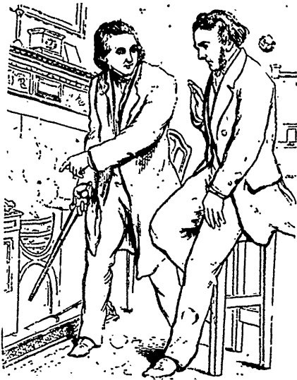
HOW THE FIRE GOES OUT.

"He was wounded for our transgressions, He was bruised for our iniquities."—Isaiah liii. 5.