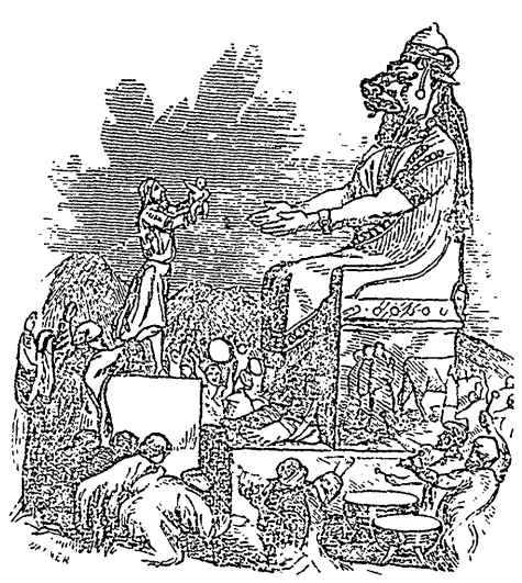
The British Idol.

sensation, lest he fall unawares into danger .- Arthur's Home Gazette.