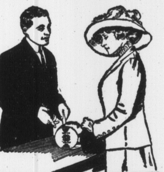
"No! They are not all the same."