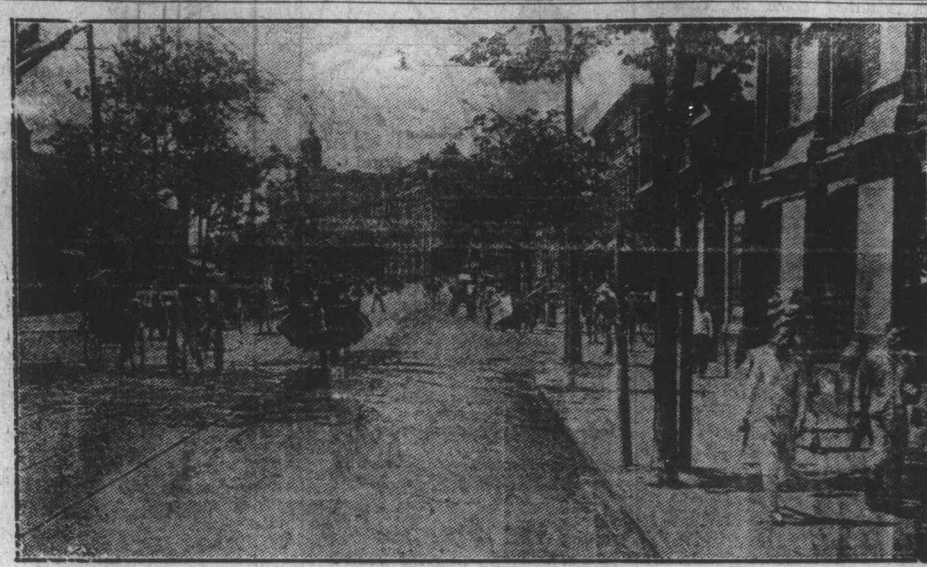
WHERE MARINES HAVE LANDED TO PROTECT SHANGHAI

When the tea drinking habit was introduced to Britzin tea cost five pounds, and often more, a pound, and tea caddies were elaborate and exquisite things of ebony and ivory, satinwood and marquetry. Boiling water used to be brought to the table by the serving maid, and the mistress would turn to her beautiful box to bring out the leaves. Nowadays many a family caddy is merely the grocer's colored tin. However, if you happen to possess an old tea caddy you are entitled to be proud of it as an antique treasure.