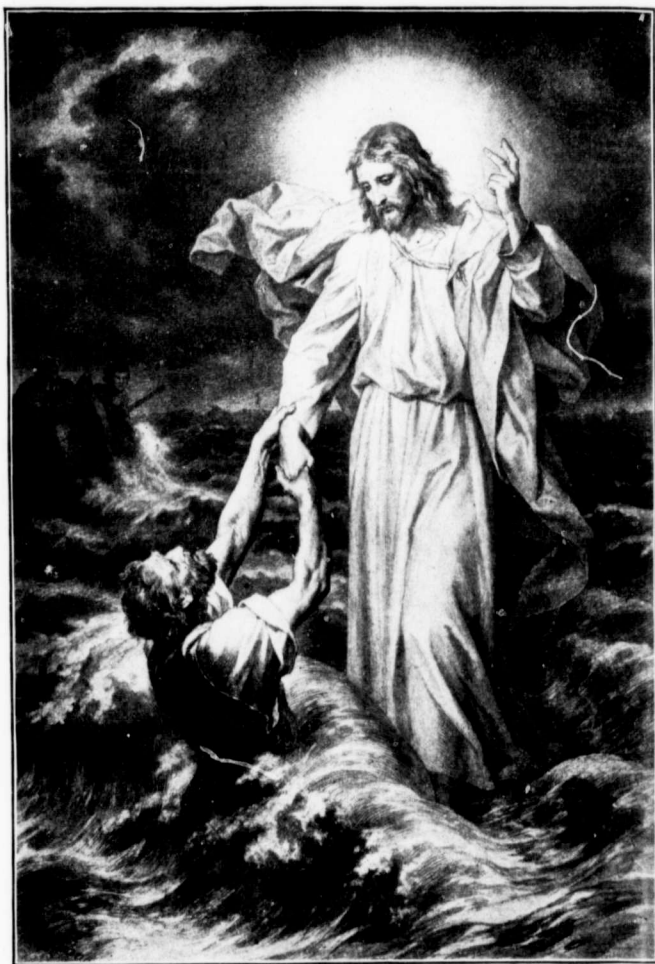
Our Lord saving Peter.