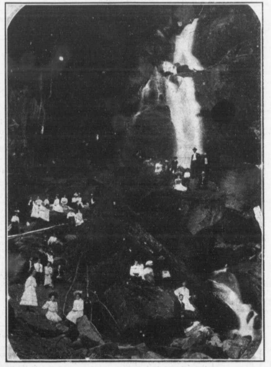
BRIDAL VEIL FALLS, PITT LAKE, B.C. The young folks scattered on the tocks are the members of the British Columbia Summer School, held at New Westminster in July—80 page 479.