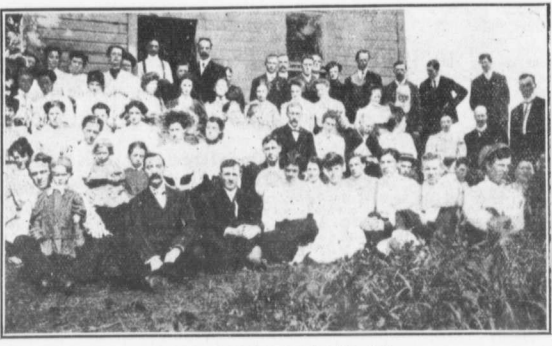
SUMMER SCHOOL AT ROCK LAKE, MAN.

The success of the school is very largely due to the fine management of the Execu-