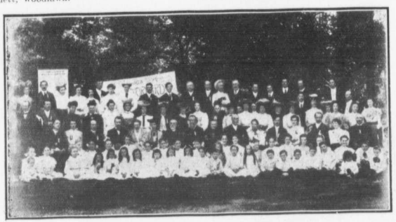
BRITISH COLUMBIA SUMMER SCHOOL

The League of Dundas Centre Church, London, publishes a unique programme for the first of July Epworth League