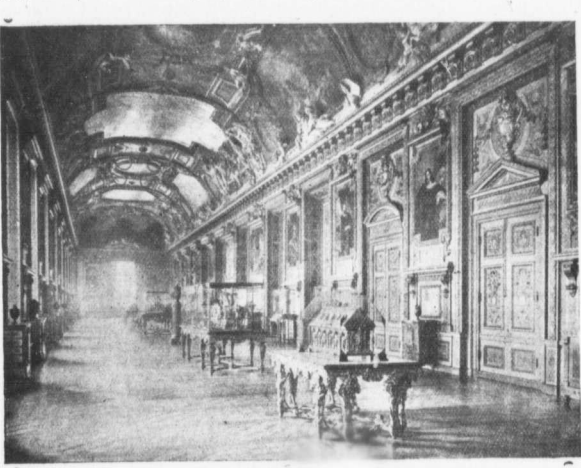
ONE OF THE GALLE

If there be a st of young people in the world who ought to push the use of good literature, so as to shut out and put down the bad, it is the young people of the Epworth League, and for these reasons: Here, as elsewhere, we must overcome evil with good; we must preoccupy the ground. And the good books and all else of good literature are here. We don't have to create it; it is furnished to us at low prices, and we have only to take and use it.