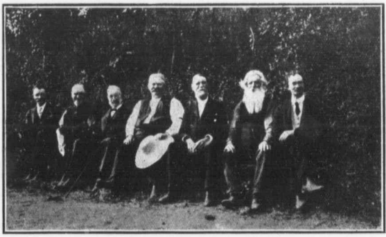
THE OLD MEN LOOK ON APPROVINGLY