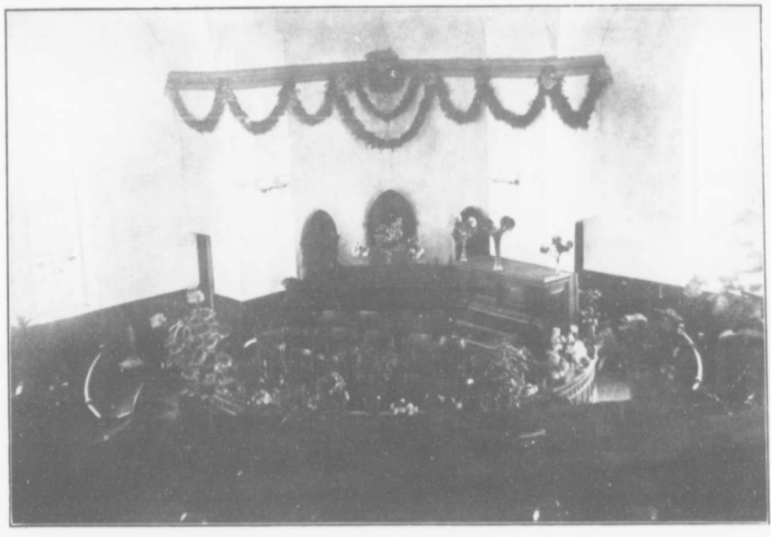
Interior View of Knox Church at time of Jubilee Celebration, June 1909