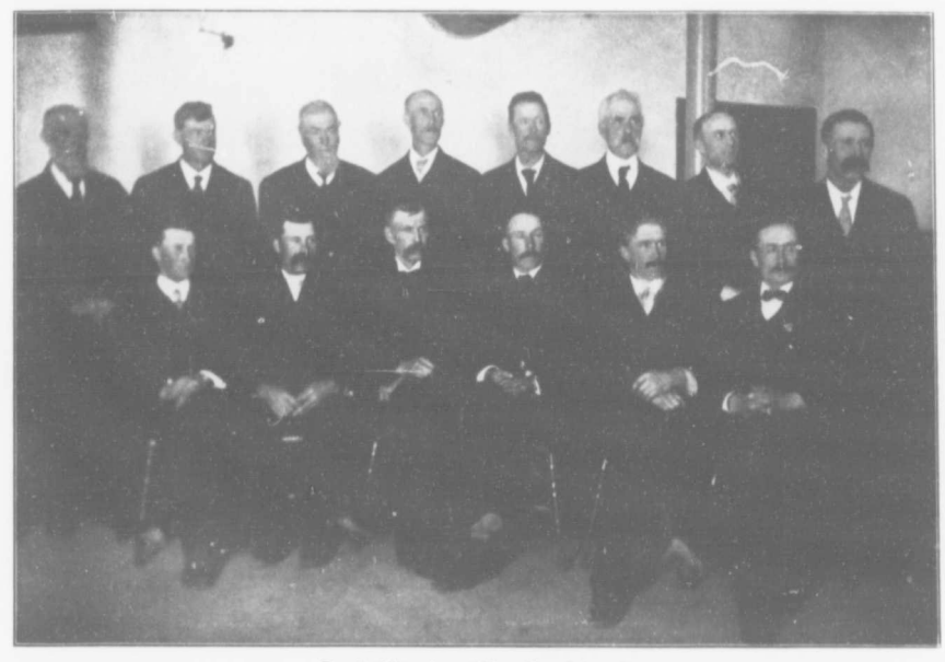
Board of Managers of Knox Church for 1809