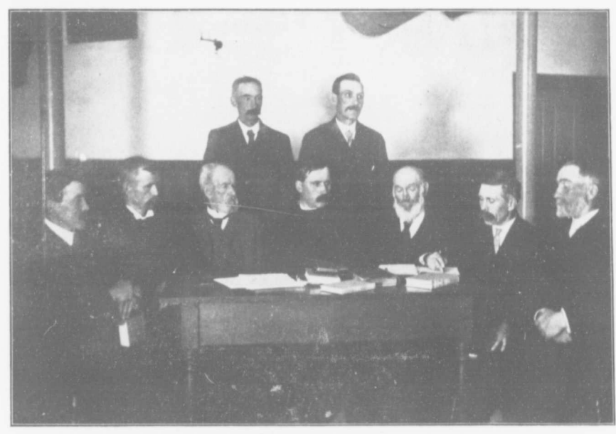
Session of Knox Church