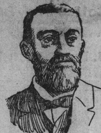
CHARLES JULES GUITEAU