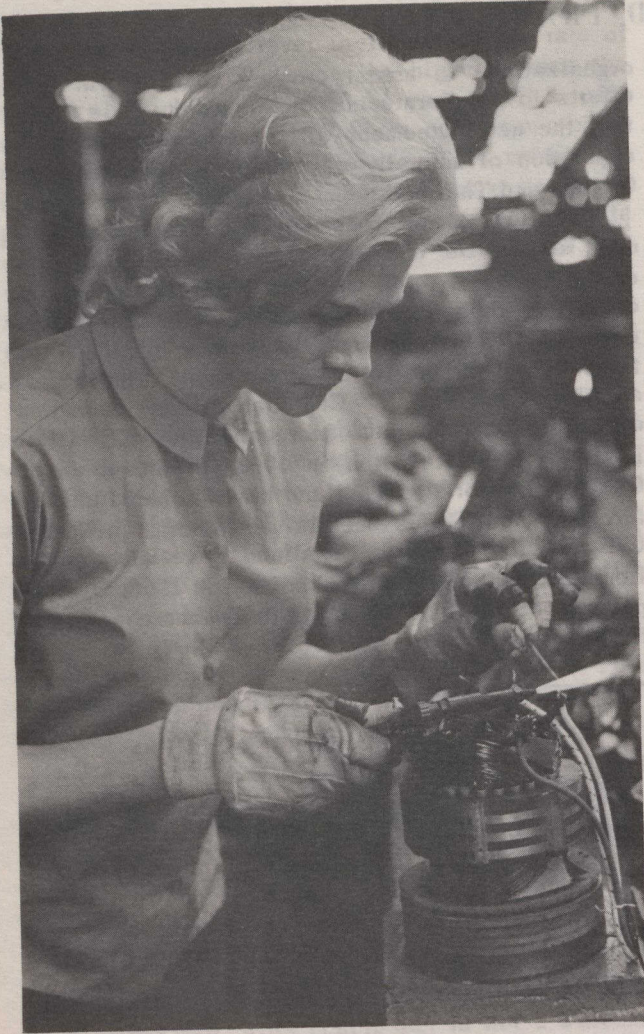
At work in Canadian Westinghouse.