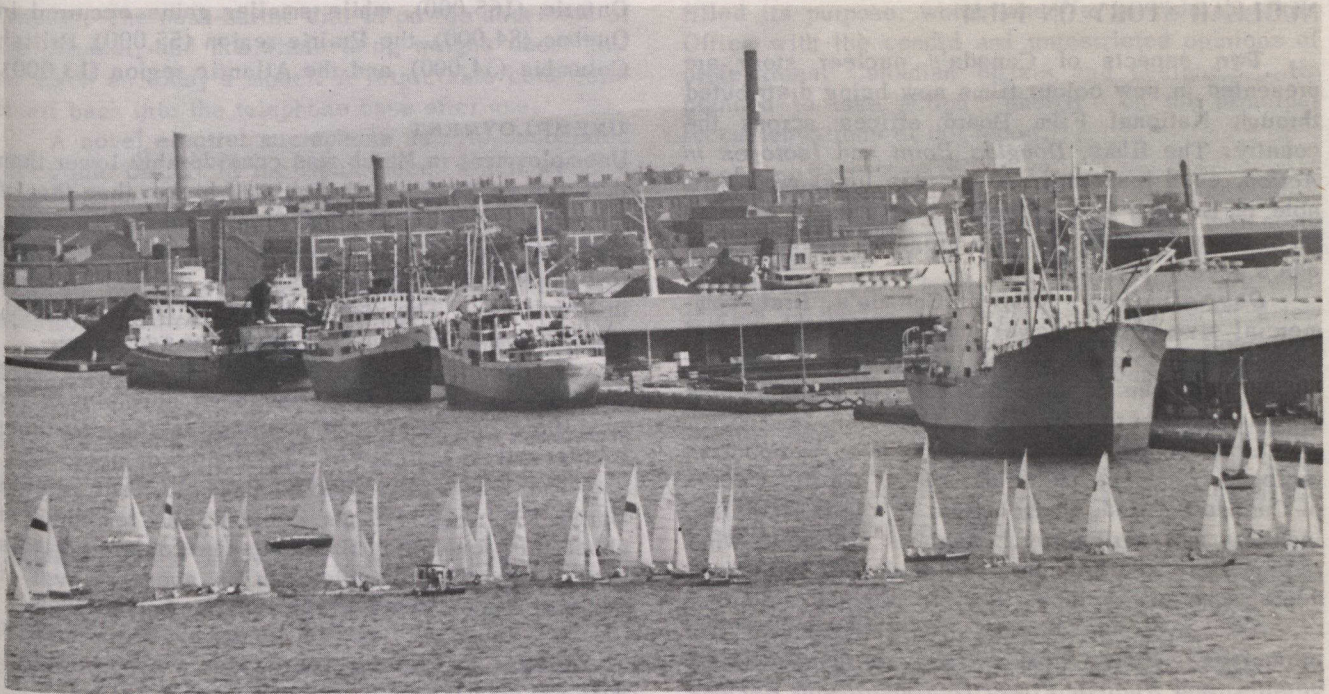
Yachts cross Hamilton Bay where world's shipping does business.