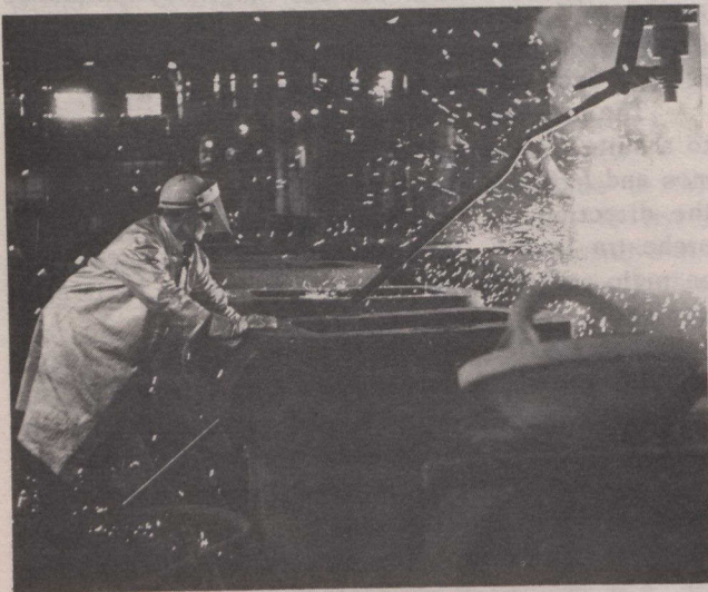
Inside one of Hamilton's massive steel works.