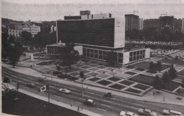
Hamilton's City Hall.