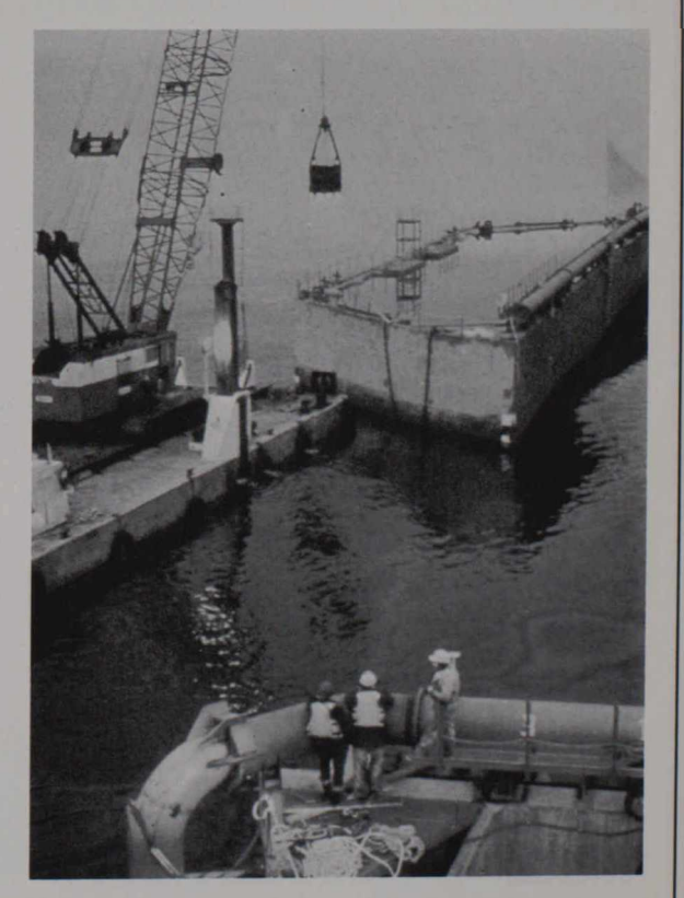
The building of Tarsiut.

The islands are relatively easy to build in water less than sixty-five feet deep where great quantities of sand and gravel are nearby. The sand and gravel are dredged from the sea floor, carried to the island site and dumped, forming a foundation hill called a berm. This procedure becomes