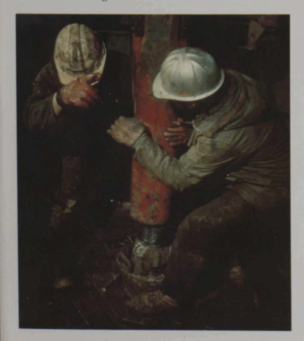
Drillers on Sedco 709 in the Hibernia field.

All ocean drillers use essentially the same approach. A crane lowers a section of steel pipe through a square hole in the bottom of the ship or rig. Other sections are added until the riser, as it is called, reaches the floor. In northern seas a shallow valley, called the glory hole, is dredged in the sand to protect the wellhead equipment from ice keels that might scour the bottom.