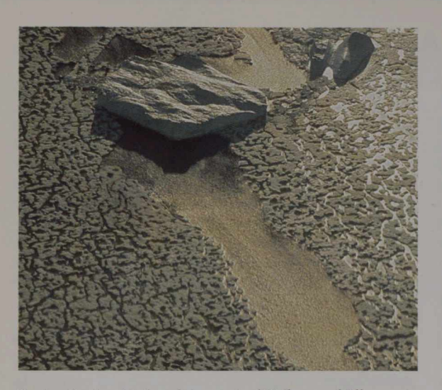
Sea ice, fjord and iceberg between Axel Heiberg and Ellesmere Island, Eureka Sound, N.W.T.

difficulty breaking through flat ice up to six feet thick. They do have trouble when they meet multi-year ice ridges which may measure forty feet from top to bottom. They go around them if they can, but some are more than three miles long, and the breaker must then bang into them, back up and bang again, over and over.