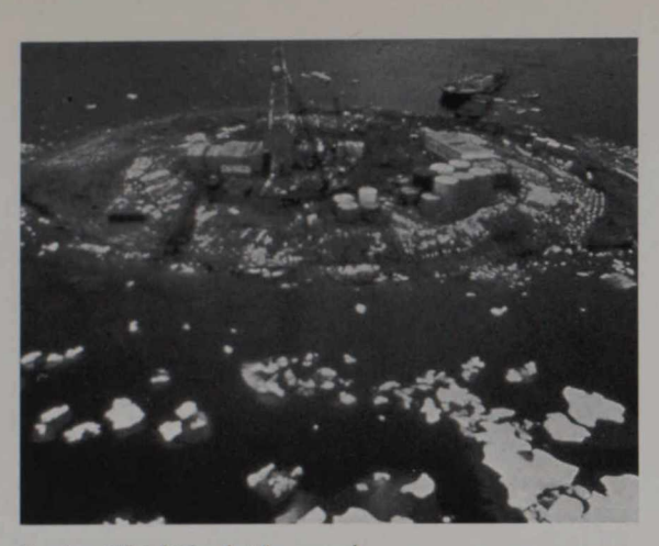
Esso's artificial island at Issungnak.

prohibitively expensive, however, when the site is in deep water.