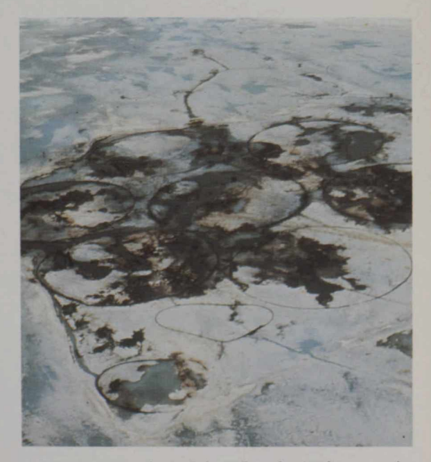
Oil rising to the surface in Balaena Bay: the circular pattern is caused by containment booms under the ice.

Last summer 3,300 gallons of crude were released into a bay off Cape Hatt, on the northern tip of Baffin Island, and two days later another 3,300 gallons, to which a chemical dispersant had been added, were spilled into another bay nearby. The spills will be monitored over the next several years and the rates of recovery in the two bays compared.