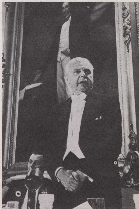
John Diefenbaker in front of a portrait of John A. MacDonal, Canada's first prime minister.

In 1916, John Diefenbaker was awarded his Bachelor of Arts and Master of Arts degrees from the University of Saskatchewan and shortly afterwards, at the age of 20, he went overseas as a lieutenant in the 196th Western University Battalion. The next year Mr. Diefenbaker — the first veteran to become a Canadian prime minister — was injured in France and sent back to Canada. He received his law degree from his alma mater in 1918 and subsequently acquired