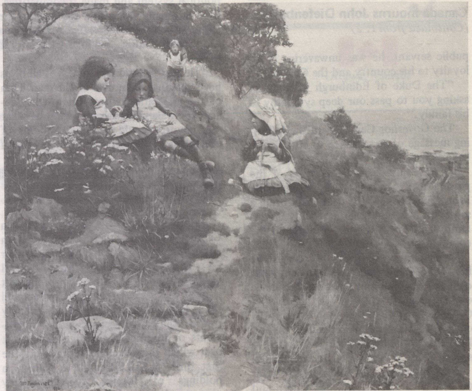
William Brymner, A Wreath of Flowers , oil on canvas, 1884.

As a landscape painter, William Brymner painted directly from nature: He said, "the artist must get as near to nature as possible, be inspired by her at first hand...." His murals of harvesting scenes on the Island of Orléans, done in 1899 and 1900, were inspired by the landscape of the lower St. Lawrence River valley. He continued to employ a limited palette, his colours showing the influence of Puvis de Chavannes. But, by this time, the tight brushstroke of his earlier period had softened. Some of his landscape paintings, done in his studio at