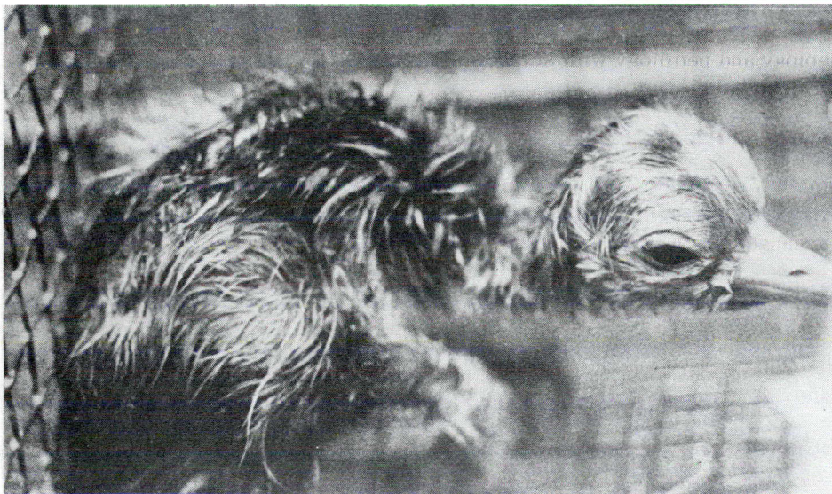
Interior-U.S. Sport Fisheries & Wildlife

This experiment is one of several efforts under way to restore the endangered whooping crane to a healthy state in the wild. The first whoopers bred and raised in captivity at the Patuxent Wildlife Research Center have reached sexual maturity and have already laid three eggs. Two were infertile, one was hatched but the bird died some two weeks later. Eventually, offspring of the captive whoopers may be released into the wild.