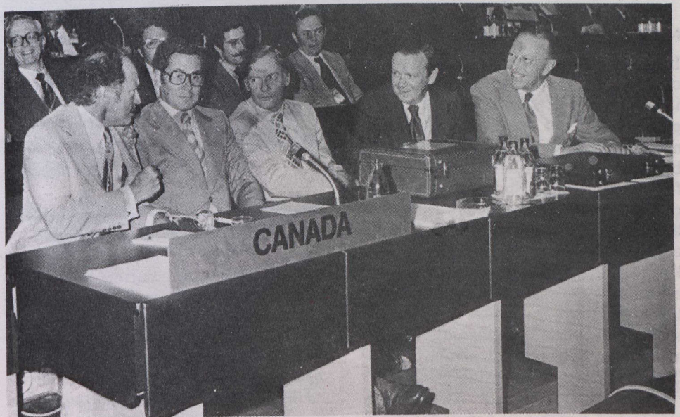
Mr. Trudeau (extreme left) talks to some members of the Canadian delega-

spread rapidly to all other areas. Yet in another sense such a belief is arrogant. Europe is not the world. Nor are many of our concerns, vital though they may be, the concerns of others. Whatever stability this Conference anticipates in Europe will be short-lived if we do not seize the opportunity now offered to us to create elsewhere the conditions necessary to permit standards of living to be raised, to permit