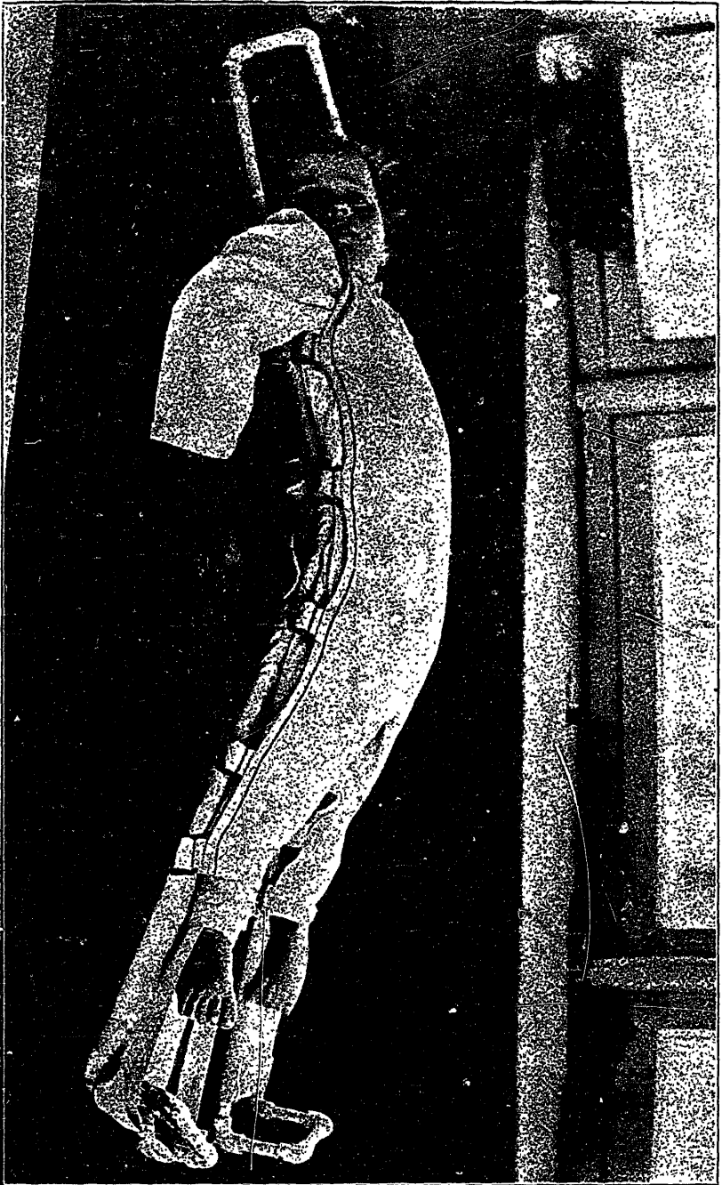
Fig. 2. A NEW SPLINT FOR LUMBAR POTTER'S DISEASE. Note that the splint forms with the table a double inclined plane which assures hyper-extension. The head and foot extremities are raised in order to give a basis from which to get extension.