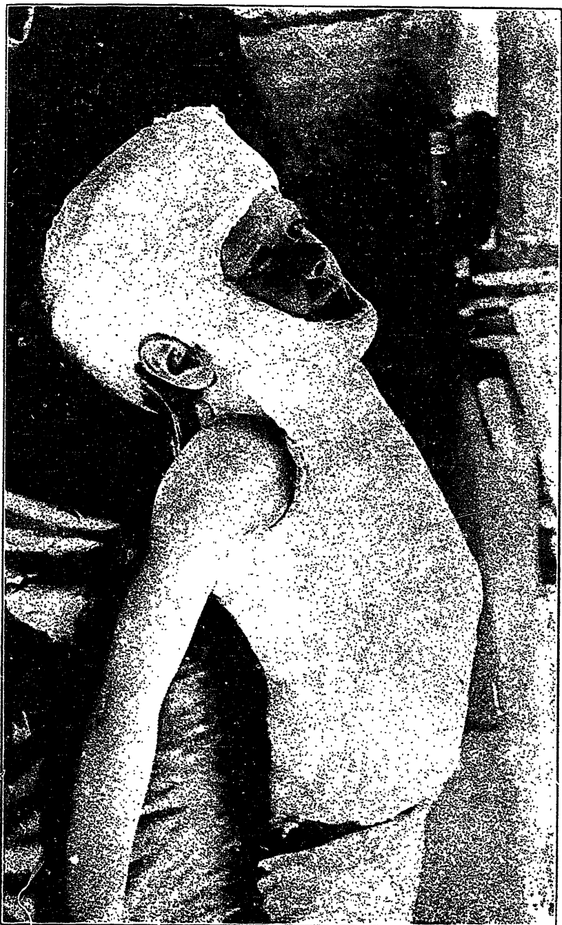
FIG. 1. THE PLASTER-SPLINT JACKIEP.

Note the edge of the plaster splint appearing behind the ear and shoulder. The edge of this is bound with adhesive plaster.