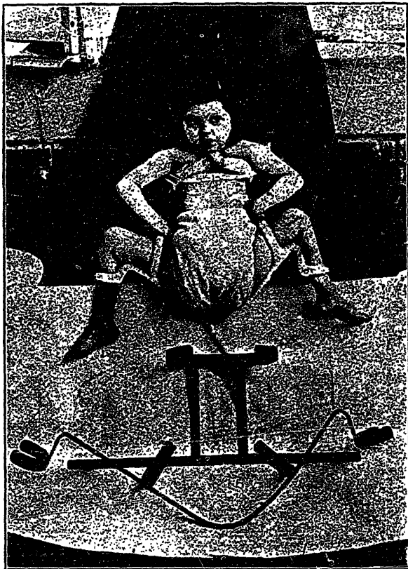
FIG. 3. A BRACE FOR CONGENITALLY DISLOCATED HIP.