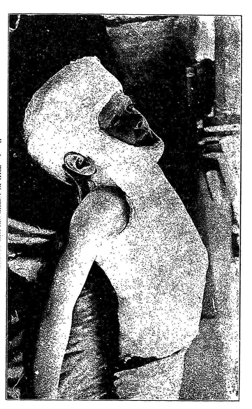
FIG. 1. THE PLASTER-SPLINT JACKET.

Note the edge of the plaster splint appearing behind the ear and shoulder. The edge of this is bound with adhesive plaster.