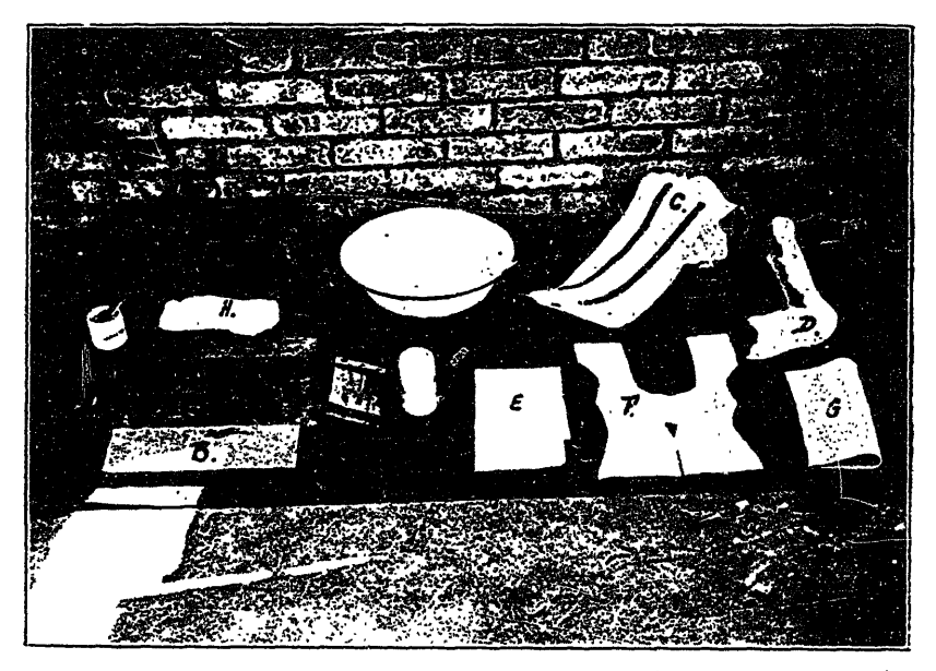
Fig. 1. A and B are the plaster box both open and shut. The control of the plaster splint. Does a Hergott splint. Fig the plaster bib used to control the head and neck in such jackets as that pictured in Fig. 1.