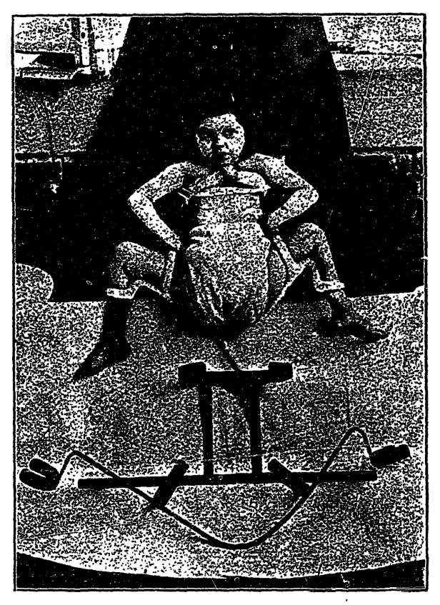
Fig. 3. A BRACE FOR CONGENITALLY DISLOCATED HIP.