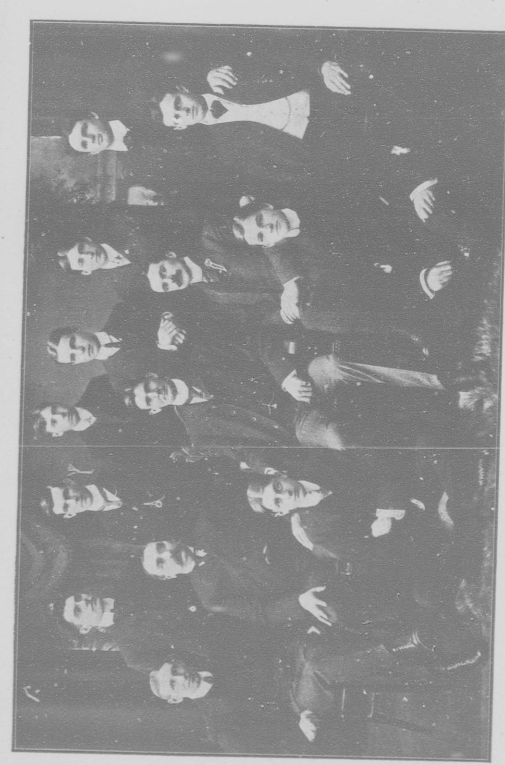
THE EXECUTIVE OF THE O. A. C. ATHLETIC ASSOCIATION,