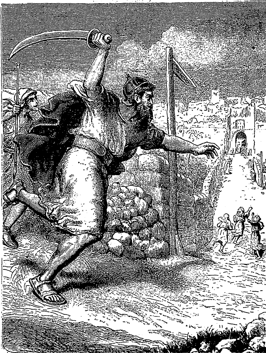
THE AVENGER OF BLOOD.

But four days ago he was quite well; he was standing with her and many of the neighbors to watch the procession of the god of the fields go by; he had seemed afraid as the idol passed, and by and by had fallen asleep. He waked up in terror, crying, "Oh, mother, the Lao-ya (the idol) has hold of my hand, and is dragging me to the temple, to burn incense." The mother, in great fear, ran out and bought two dollars' worth of incense, candles, paper money, etc., and went quickly with them to the temple to worship; all the next day she knelt before the idol pleading for the life of her child, and all