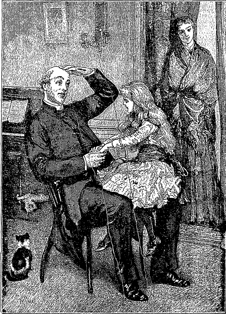
"YOU ARE THE YOUNG CANON."

My charge was an important one for a youth, and though possessing a muscular frame and a mind full of energy, it required all to keep pace with the duty devolved upon me. I lived at a considerable distance from what are called the means of grace, and the Sabbaths were not always at my command. I met with none who appeared to make religion their chief concern. I mingled, when opportunities offered, with the gay and godless in what were considered innocent amusements, where I soon became a favorite; but I never forgot my promise to my mother.— Child's Companion.