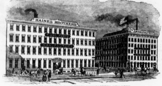
HAINES BROTHERS PIANO-FORTE MANUFACTORY, NEW YORK