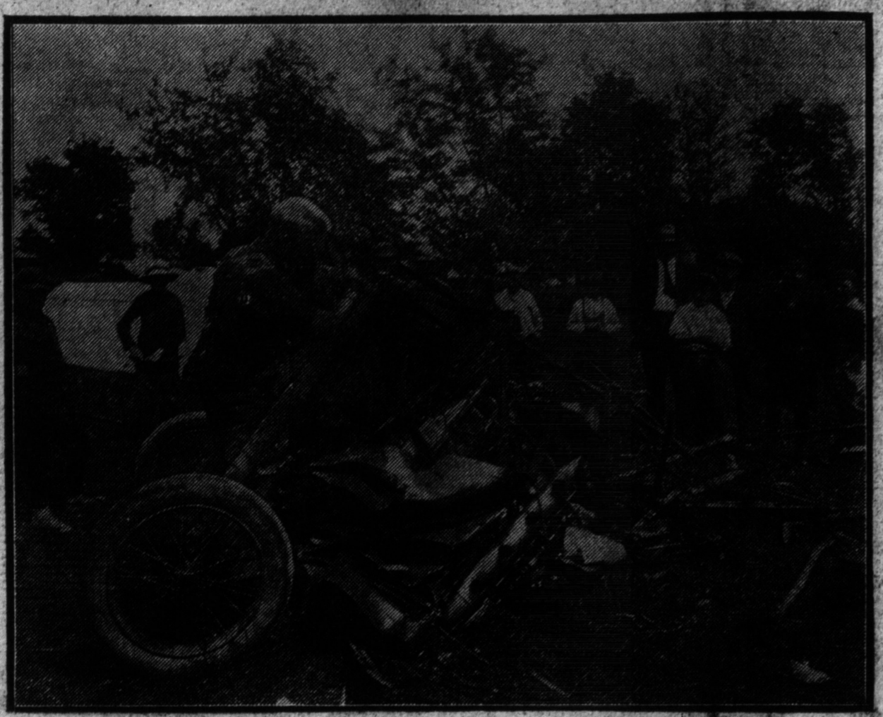
Scene of yesterday's airplane wreck, near Bedford Park road, which resulted in the death of United States Flight Cadet Stephen H. J. Dorr, whose plane collided with another while in flight.

The binders are busy all over Ontario in the wheat, oat and barley fields; many mowers are also going on the balance of the hay crop. Corn and roots are rushing ahead alike, the widespread rains. Potatoes promise a big yield. The corn is still backward. Labor is scarce, but harvesting is fairly under way. Thrashing machines are at work on the oats; there is much need of horse feed. Every team that can be spared from the harvesting is put at plowing for the sowing of fall wheat. There is lots of good pasture for cattle and sheep. There is a good demand for old hay in the towns and cities. DINEEN'S MEN'S HATS SALE. There is always something offering in men's hats at Dineen's on Saturdays. This Saturday a clearance sale is in progress, and all summer straws and Panamas are being cleared out at half price. Although it is mid-summer, Dineen's are holding an end-of-the-season sale, and prices are reduced to much less than cost. Dineen's, 140 Yonge street.