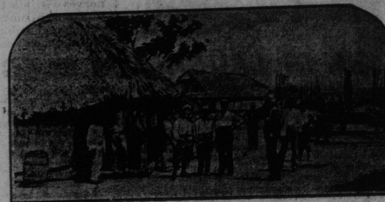
Tobacco Centre at Hato Guano, on Our Property.

Terms—25 per cent. cash; 25 per cent. 30 days; 25 per cent. 60 days; 25 per cent. 90 days; or terms can be arranged.