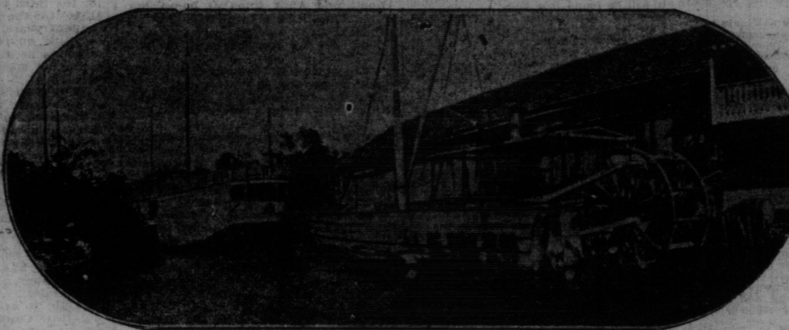
Guadiana Wharf, Active Shipping Centre of our Property.

The soil, as you know, is a sandy, loose earth, easy to cultivate and in this respect much more desirable than any other land to be found in Cuba, because, while it is economical to cultivate, it is the best land in the world for oranges.