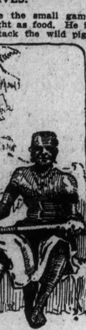
Two Papuan Warriors.