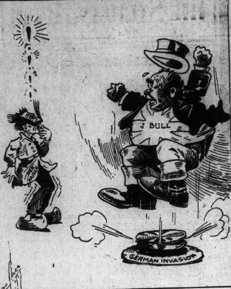
John Bull—"And I'll bust your winter one next!"