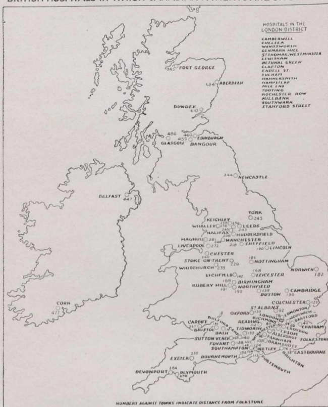
MAP No. 1.