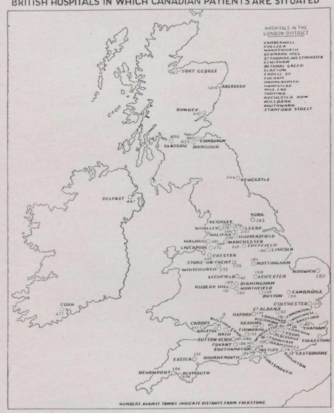
MAP No. 1.