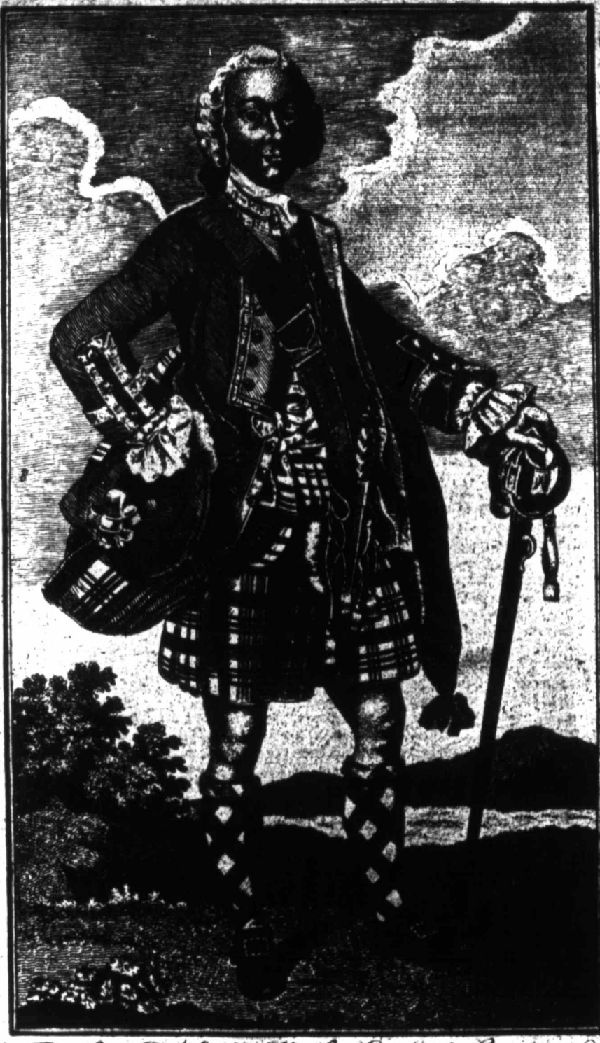
Capt "General & Governour in Chief, of his Ma jettys Forces in North America: and me of the Sixtern Perso of Lattand.