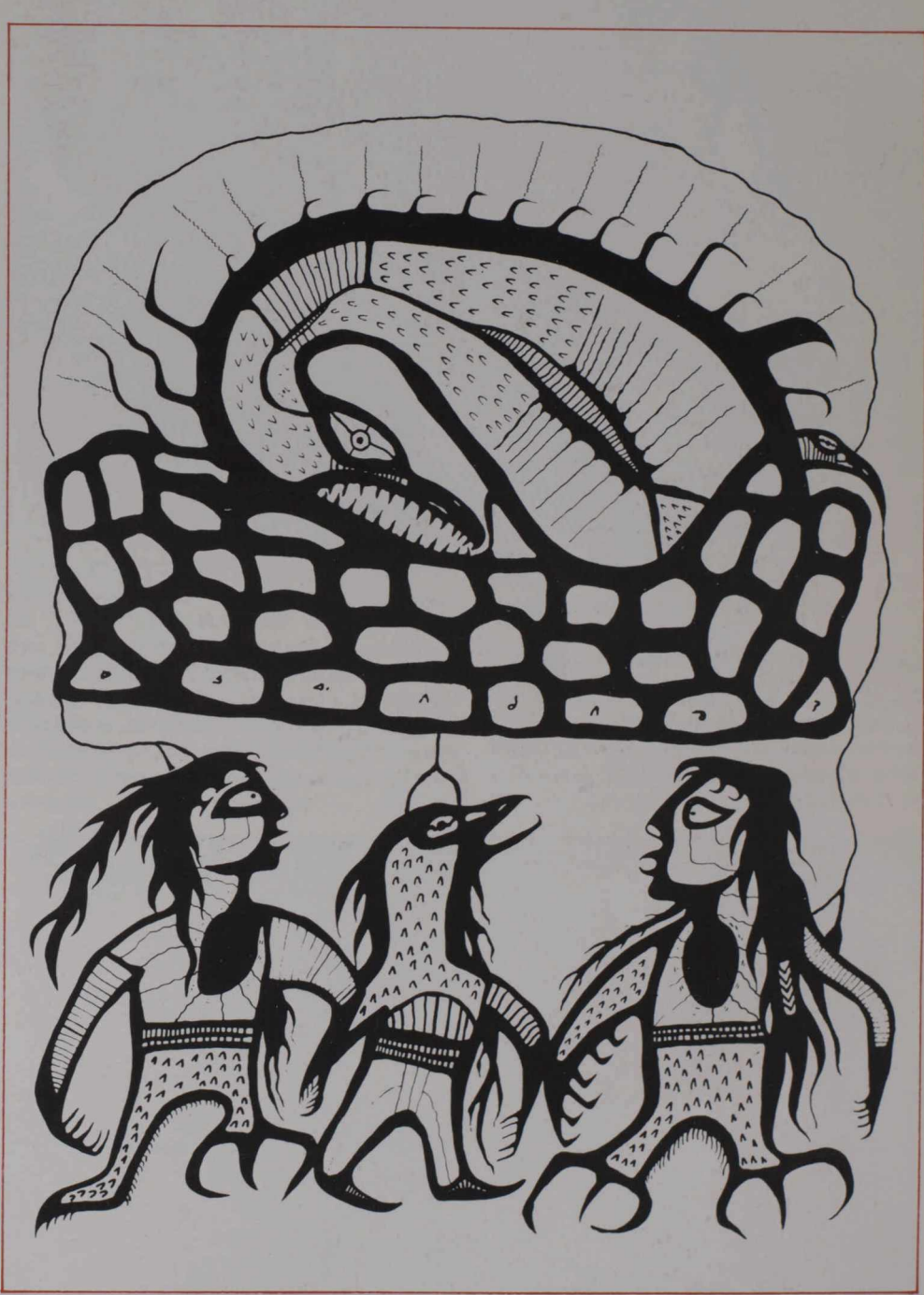
Norval Morrisseau's illustration of the Ojibway legend in which three brothers meet a Thunderbird on the Forbidden Mountain.

The heroes of Indian folklore are not only named after animals: sometimes they can also turn into that animal by magic if it helps them in their adventures. So it is in Sketcho the Raven , a book about the adventures of an Indian boy with magic powers who pursues his wicked magician uncle to avenge the death of his three