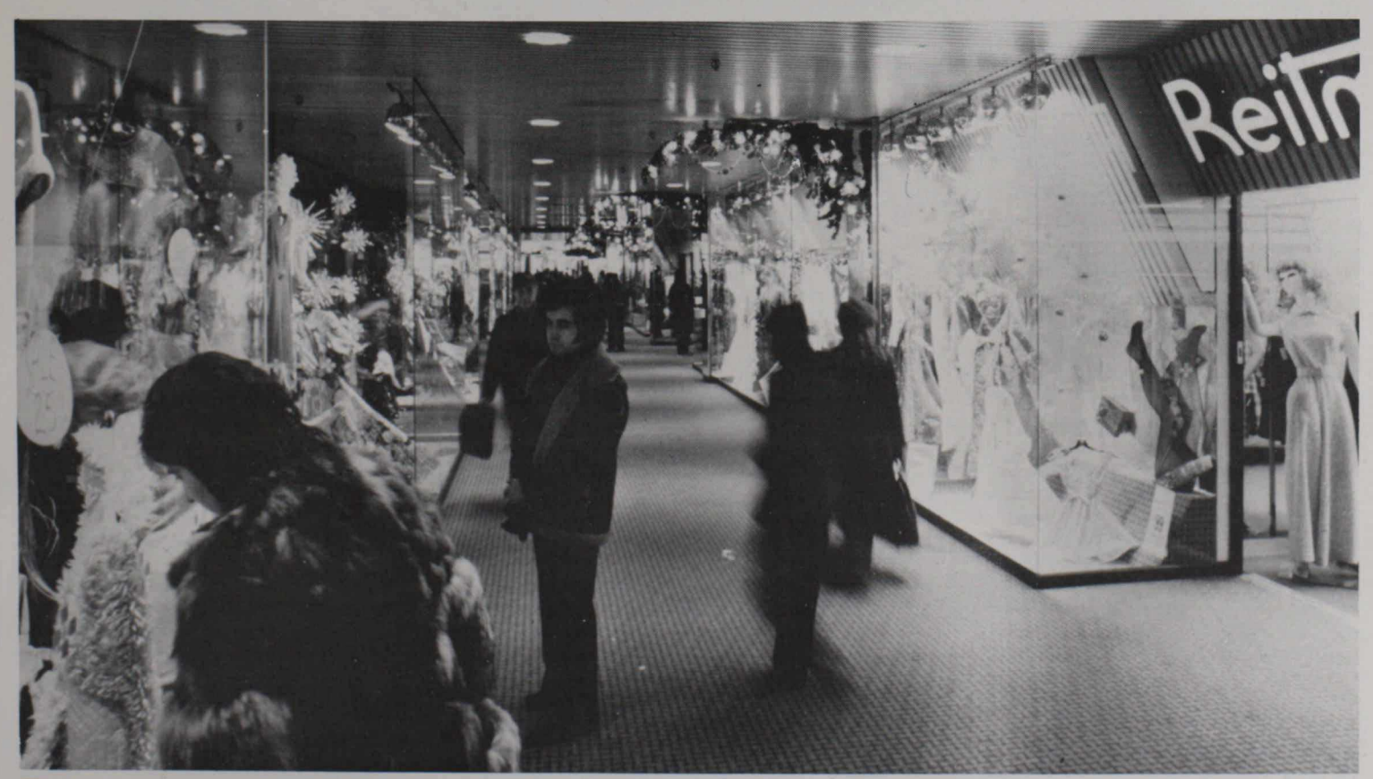
The shopping concourse at Place Ville Marie is part of a 30-acre "underground village", described on Page 11.

It pioneered, among other things, an underground city that now extends some 30 acres and attracts architectural experts from around the globe. Whimsical tales abound of visitors who come swaddled in furs against the Montreal winter only to discover a room-temperature world that one designer describes as the first authentically Canadian architecture. (See article on page 11).