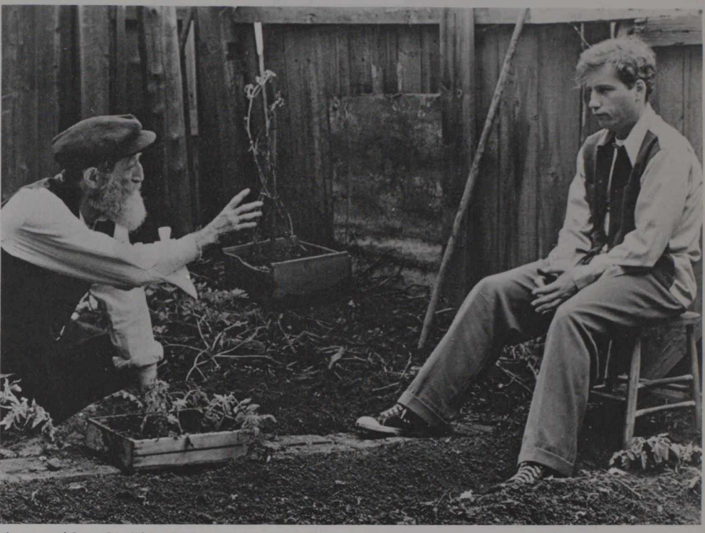
A man without land is nobody.

Imagine a city-bred voungster from Montreal, a cocky little blue-eyed Jew-boy with time off from serving meals to the rich in a Laurentian holiday resort, taking his first look at a beautiful mountain lake. Pines and red maples edge the water. He wheels round on the rock where he is standing and fiercely asks the local girl who brought him if she has ever shown it to anyone else? She hasn't, and she mustn't, not on any account. He makes her promise. Not that he is jealous about the girl nothing as ordinary as that. He has just decided that he is going to buy the lake, to build his own resort. He'll get the money, somehow.