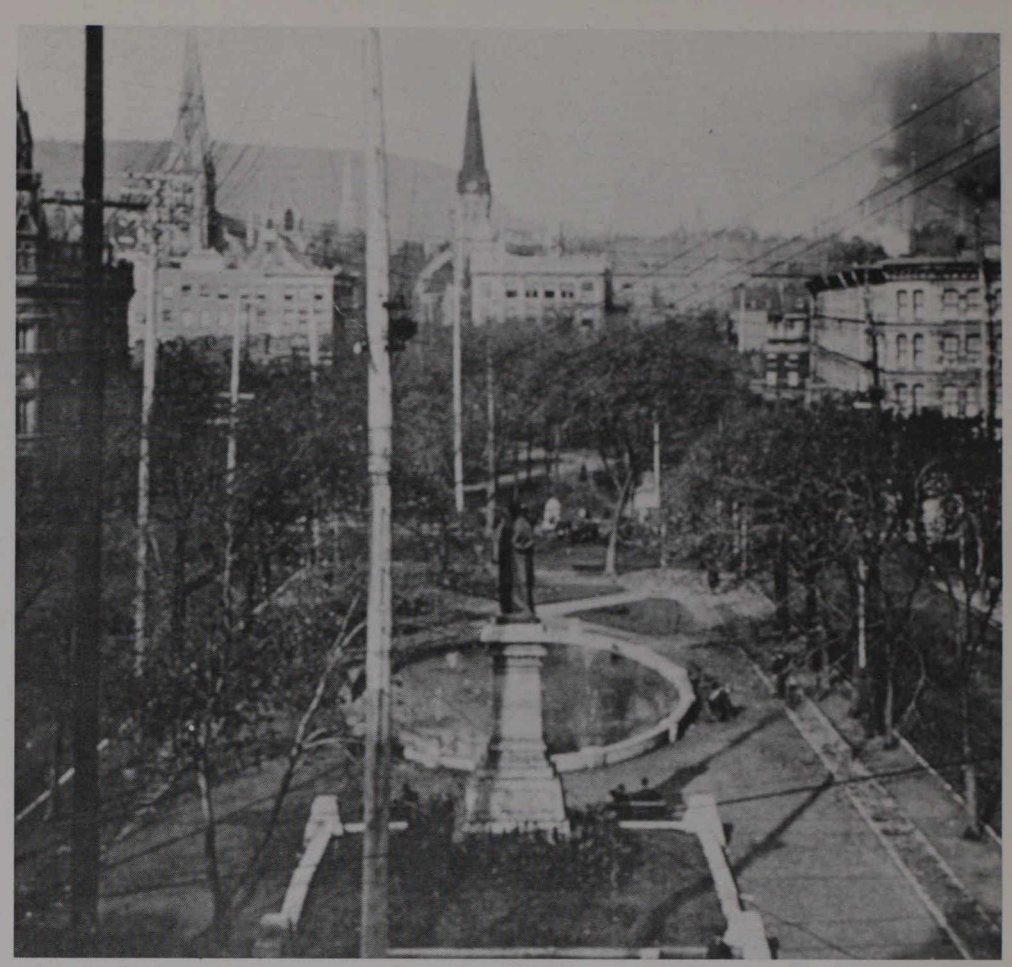
The trans-Canada highway now slashes through this scene of Place Victoria, but Her Majesty's statue still looks on.

What is the present population makeup? The 1971 census counted 1,699,000 citizens of French mother tongue in the metropolitan area, 575,991 of English mother tongue and 324,897 "others"—that is, people who learned as children and still speak a language other than French or English. An historic change in Quebec's population pattern constitutes an unsettling component of life in the pluralistic city, the province's main cockpit of cultural and economic clash. Quebec, in