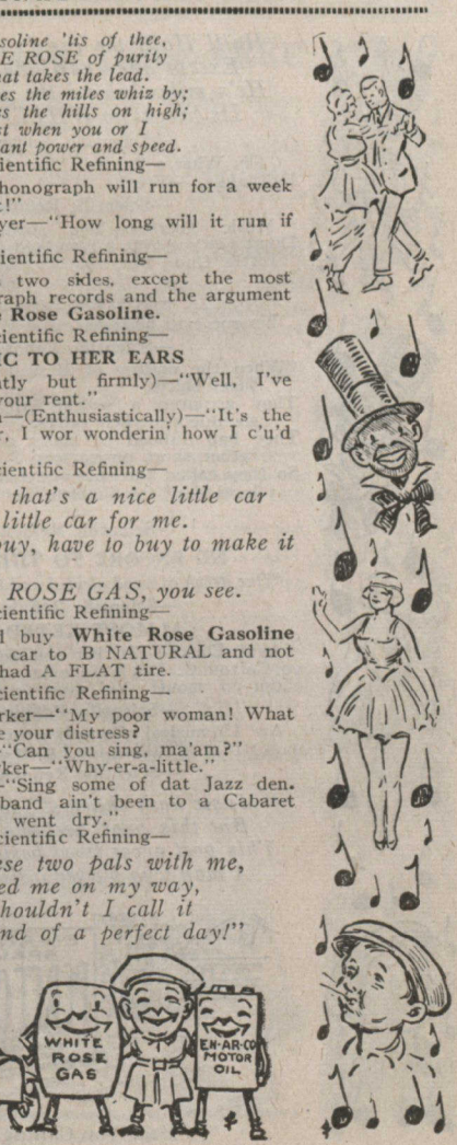
For Automobile Filling Station Locations ..... see page 16