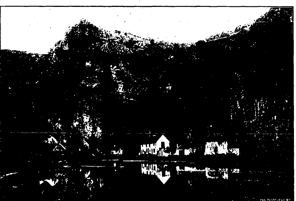
IN THE MIDLANDS OF ENGLAND.

every possible obstacle in the path of those who are promoting their welfare. No one can deny that this is the spirit that has shown itself towards ourselves and our work during the past few weeks; but, as I have written to a great many of our boys and young men who have keenly felt these cruel attacks, we can console ourselves with the knowledge that there has never yet been a great and good work for the aiding and uplifting of humanity that has not had to face the same prejudice and hostility. The Divine Master was a most unpopular man, and when He called the young children to Him and took them in His arms we have no doubt the bystanders commented harshly upon His action. Such an analogy may seem pre-