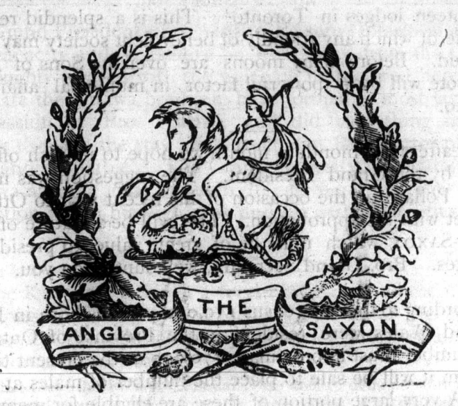
A Monthly Journal devoted to the interests of the Anglo-Saxon race in Canada.