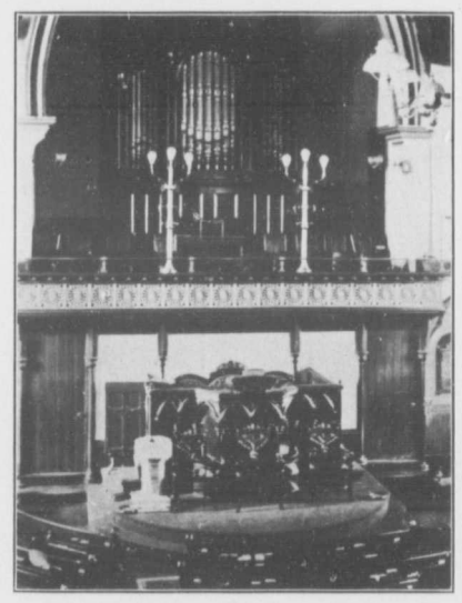
View of pulpit and choir before change was made in 1908.