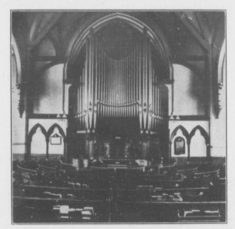
View showing pulpit, organ and choir as changed in 1908.