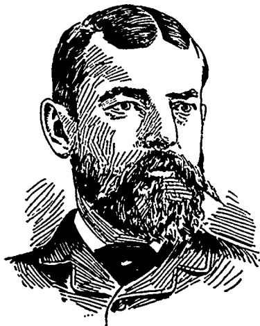
HON. SYDNEY FISHER.

THE NEW MINISTER OF AGRICULTURE FOR THE DOMINION.