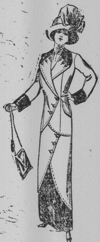
Velvet and broadcloth, used together, would make a good suit for between seasons. This model has a distinct style.