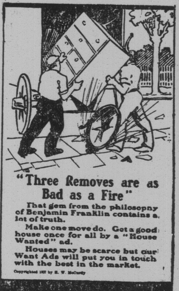
"Three Removes are as Bad as a Fire" That gem from the philosopher of Benjamin Franklin contains a lot of truth. Make one move do. Get a good house space for all by a "Home Wanted" ad. Houses may be scarce but our Want Ads will put you in touch with the best in the market. Copyright 1911 by E. F. McElroy

(From the Shoe Retailer) A Haverhill shoemaker has been granted patents giving him the right to make camps and tops of a vegetable fibre which he has invented and perfected to be used in the manufacture of shoes have been made of this material, which appears to be a good substitute for leather. The fibre is said to be particularly adaptable for warm weather wear because, a woven material, air can penetrate the vamp and top. The inventor also claims that a shoe made of this material is water proof.