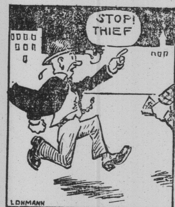
"A run for his money."

He laid his plans to swat the fly; He knew he ought to do it, And with determination high He started to pursue it. And first the parlor lamp he smashed, His wife thought it a beauty, And then into the mirror crashed Intent upon his duty. He swept the pictures from the wall, The books fell on his toes; And when he thought to end it all The fly lit on his nose. At this the man began to frown, And fast from room to room He chased the fly, up stairs and down, To whack it with a broom. The furniture was overturned, The house was all upset, But with desire to win he burned; Said he, "I'll catch it yet!" His wife returned, her heart was sad With grief too deep to mention. "It looks," cried she, "as though you had Been holding a conversation!" And then I know that this is tough, But then he caught it sure enough. Spokesman Review.