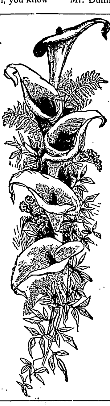
"Consider the Lilies."

The country road was still very rough, where heavy teams had left deep ruts in the mud, and the wise horse chose her way care-