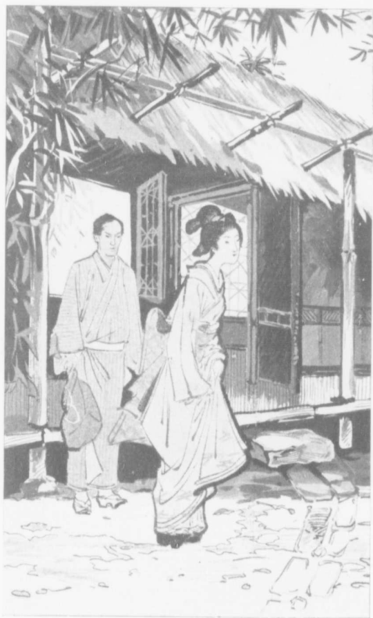
KOTO WOULD NOT MARRY.