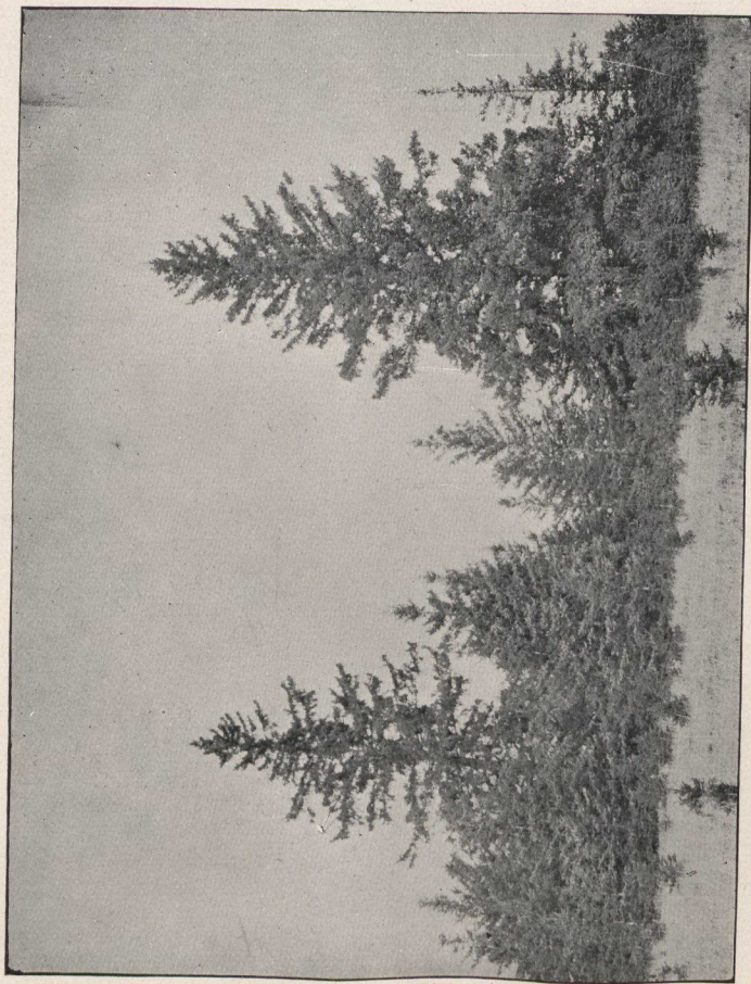
White Spruce Seeding the Prairie, Sprucewoods Reserve, Manitoba.