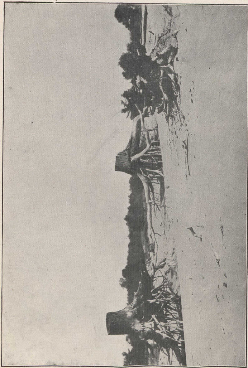
White pine stumps on a sand dune in Norfolk County. Note the depth to which the roots penetrate. On such soil annual shallow-rooted crops have little chance as compared to the deep-rooted trees.