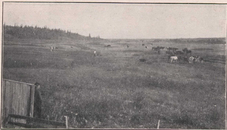
Grazing, Riding Mountain Reserve, Manitoba.