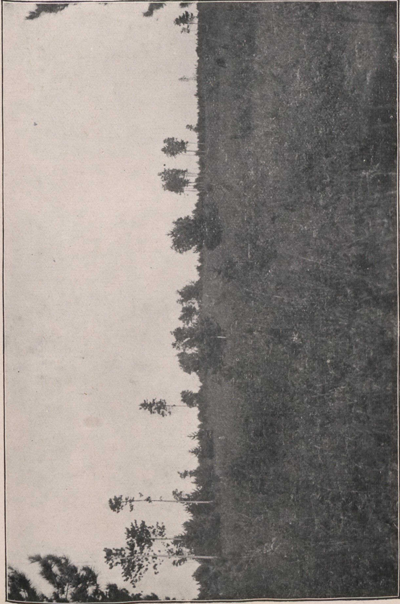
“Pine plains” in Simcoe county. There are about 50,000 acres of this type of land in this county. It is covered chiefly with Red Pine and scattering White Pine.