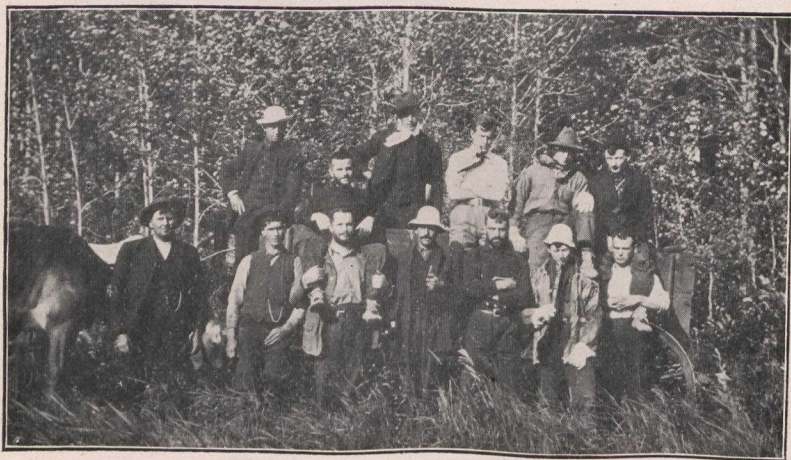
[Photo by S. Witten Forest Survey Party, Summer 1908. Riding Mountain Reserve, Manitoba.