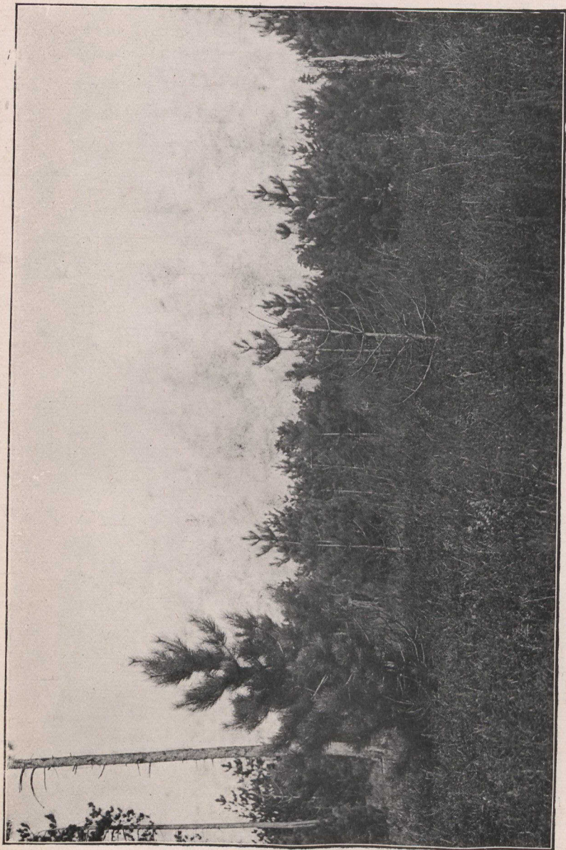
Near view of Red Pine reproduction on the pine plains. Note the dead pine in the foreground. These plains periodically burn over, killing the young growth. If this area were protected from fire it would soon reproduce with Red Pine. Fire protection, again, is a greater problem than reforesting.