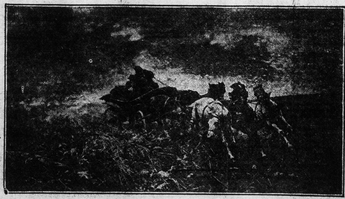
THE PRAIRIE FIRE-By Zyarna Adjukiewicz.

"The Prairie Fire" by Zygma Adjukiewicz, is the most realistic painting of human terror in impending danger that en made in the past century. The votion to realistic incident and powerful expression, but through all his work he show what he saw as he saw it. Just these qualities made the picture a masterpiece, and made a reputation as a master of a comparatively unknown painter.