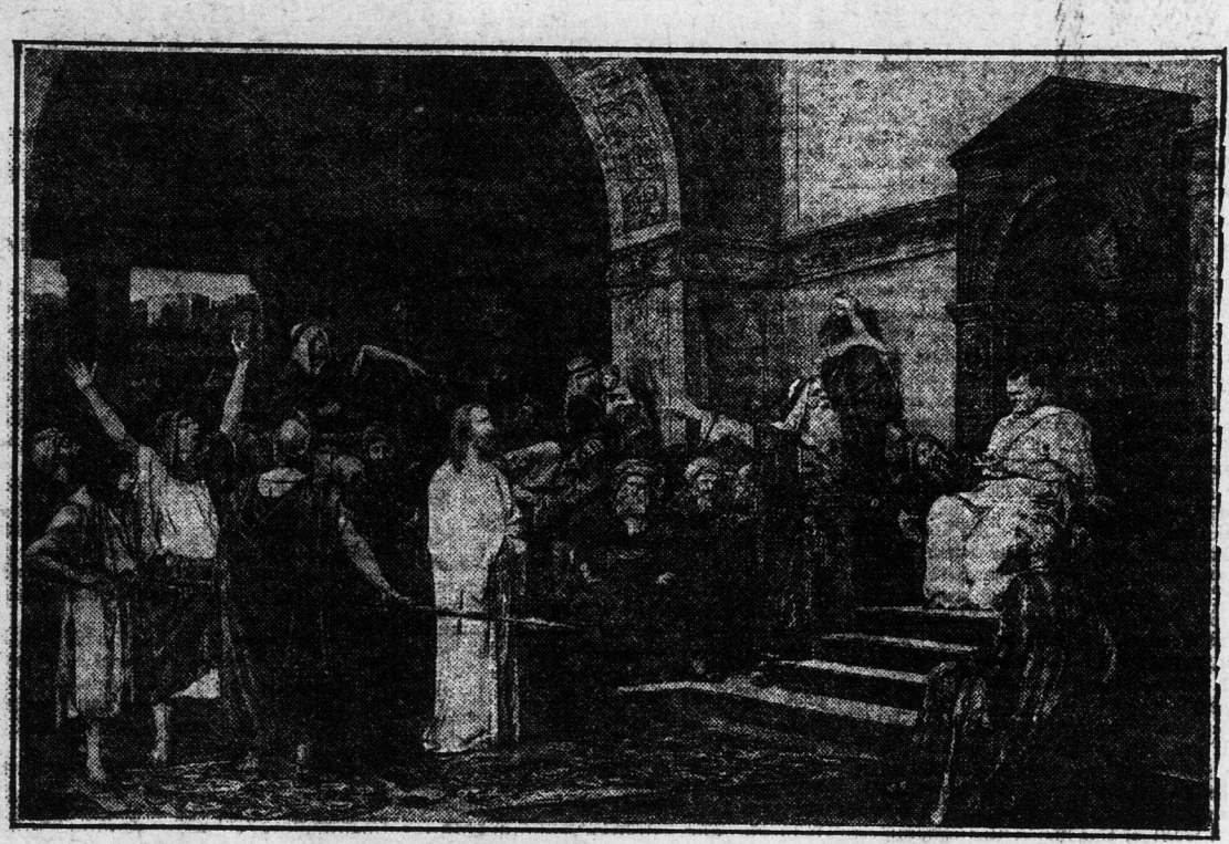
CHRIST BEFORE PILATE—(Munkacsy)

For cash renewal Semi-Weekly Telegraph annual subscription, any one of the six pictures.