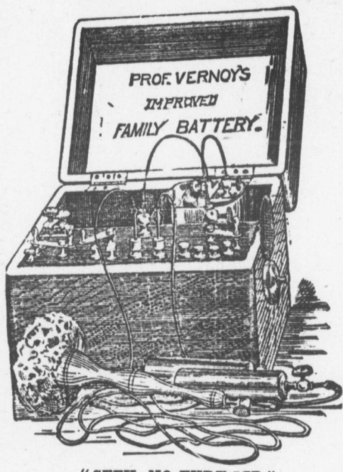
"SEEK NO FURTHER."

The $50 Batteries sold in the market do not compare with this for the cure of Nervous and other diseases. Suited to the weak and strong. Send for "The Electric Age," publishing mervelous cures. Our hand-book and guide to Domestic Electropathy (100 pages) for general use, free to each purchaser.